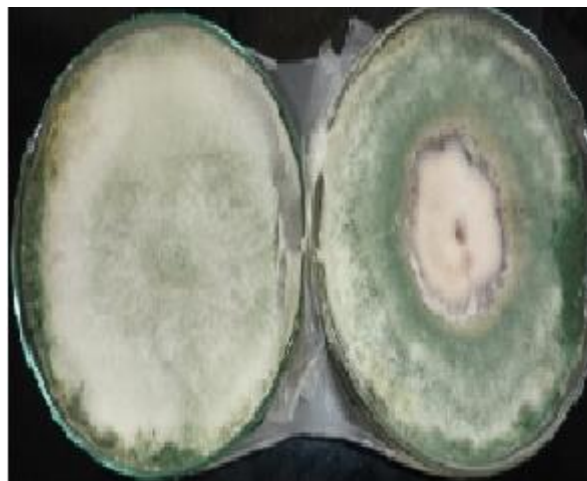
Figure 2. Effect of volatile compounds produced by T. viride on growth of F. oxysporum