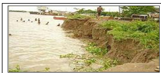
River Erosion due to Flood

The climate of Bangladesh is tropical monsoon climate influenced by the Himalayan Mountains in the north and northeast, and the Bay of Bengal in the south. High monsoon rains associated with Bangladesh's unique geographical location in the eastern part of the delta of the world's second largest river basin make it extremely vulnerable to recurring floods. Agriculture is the dominant land use in the country covering about 59% of the land, rivers and other water bodies constitute about 9% (BBS, 2002). Monsoons with varying degrees of associated flooding are anticipated annual events in Bangladesh.