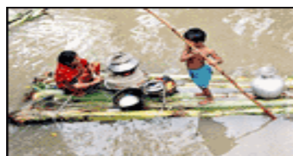
Lack of Flood Shelter facilities