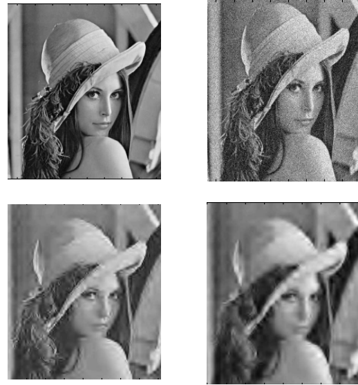
Figure 2: Resolution (256 X 256): Lena (Left top), Proposed Algorithm of Lena (Right Top), Sureshrink (left Bottom), BayesShrink (Left bottom)