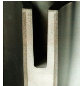
Fig. 2. An example casting with a cast-in component

the cylinder bearing surface must be in this case shaped as a cast-in element by means of etching methods. An example of casting provided with a cast-in component is shown in Fig. 2.