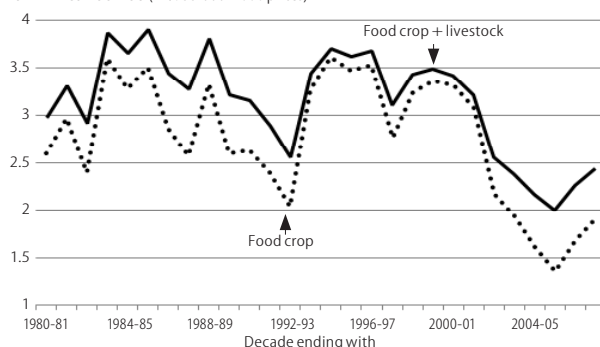
Figure 2: Growth Rate in Food Output during 10-Year Periods from 1971-72 to 2007-08 (in % at 1999-2000 prices)

Source: National Accounts Statistics, CSO.