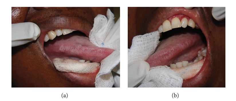
FIGURE 2: Mild oral hairy leukoplakia of the left and right lateral borders of the tongue in a 38-year-old HIV-seropositive female with a CD4+ T-cell count of 15 cells/mm<sup>3</sup>. The lesions were asymptomatic. The patient also had oral Kaposi sarcoma that was subsequently successfully treated with systemic cytotoxic chemotherapy.