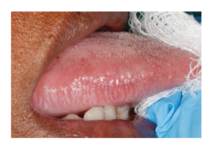
FIGURE 1: Mild oral hairy leukoplakia of the lateral border of the right side of tongue in a 44-year-old HIV-seropositive female. The lesion was asymptomatic and microscopic examination of an incisional biopsy showed hyperkeratosis, mild acanthosis, and a mild, chronic inflammatory infiltrate. Special stains showed the presence of Epstein-Barr virus.

reason treatment is to be undertaken, acyclovir, cryotherapy, laser treatment, surgical excision, or application of topical retinoids may ameliorate the lesion, but recurrence is not uncommon [4, 9–11].