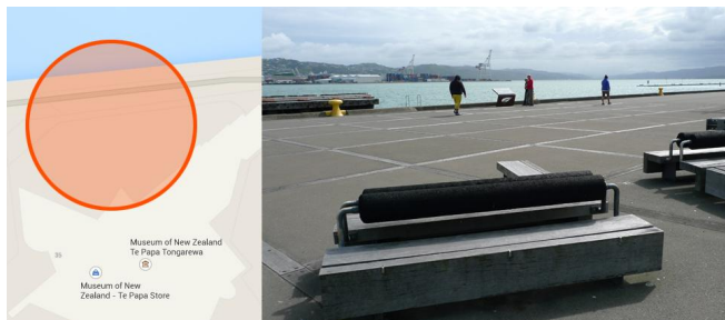
Fig.1. Northwest square of the National Museum of New Zealand.

According to above standards, as shown in “Fig. 1”, this research selected a leisure square located in northeast of the Te Papa, which is known as the National Museum of New Zealand and located in Wellington, the capital city of this country. First and foremost, Wellington is a typical windy coastal city. The local natural environment is created by not only general atmospheric circulation on earth's surface and sea breeze but also its special geographical location and terrain. The city's location, which is close to the mouth of the narrow Cook Strait, leads to its vulnerability to strong gales as well as its nickname of Windy Wellington. A report of New Zealand's national climate database showed that the monthly average wind speed in Wellington has reached force three on the Beaufort scale during the past ten years since 2004. Even more, the wind speed can reach force four during the months of September, October and November. Secondly, National Museum of New Zealand is one of the most famous and popular tourist attractions in Wellington downtown. In its northwest leisure square that faces the picturesque harbour, a lot of public seating has been installed in this ideal recreation space for a large number of visitors, tourists, citizens, etc.