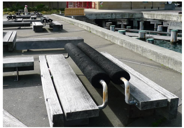
Fig.2. Eight sets public seating in the square.

In addition, this research sets the eight sets of public seating located in the above mentioned place as specific context for observation. Due to the reasonable comfort and broad perspective, these seats in “Fig. 2” could attract a considerable number of users, who brought enough data and materials for this study.