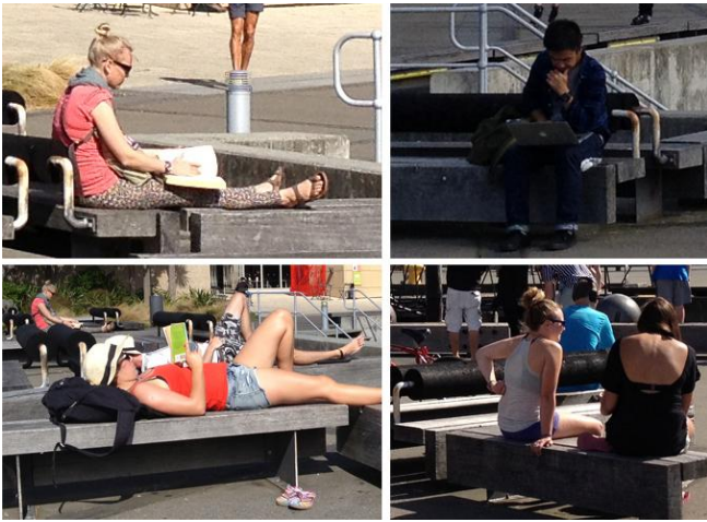
Fig.5. Users' behaviours in a windy environment of force three.

complained that wind created an annoying noise that interfered with their music. Moreover, several citizens and visiting staff who had worked in Wellington for a long period provided similar experience that an uncomfortable windy environment made them leave much earlier on a sunny day than their initial plan.