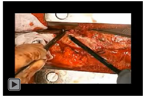
Video 1: After radical pericardiectomy, multiple longitudinal and transverse incisions are made on the left ventricular thickened epicardium using an ultrasonic scalpel aided by an apical suction device. After the left ventricle is sufficiently relieved of constriction, the same procedure is performed for the right ventricle.

Surgery for constrictive pericarditis has a mortality rate of about 6–19% [2]. Among surgical complications, bleeding is one of the major concerns. To reduce the risk of bleeding, Heimbecker et al. reported the use of an atraumatic technique of epicardial incision,