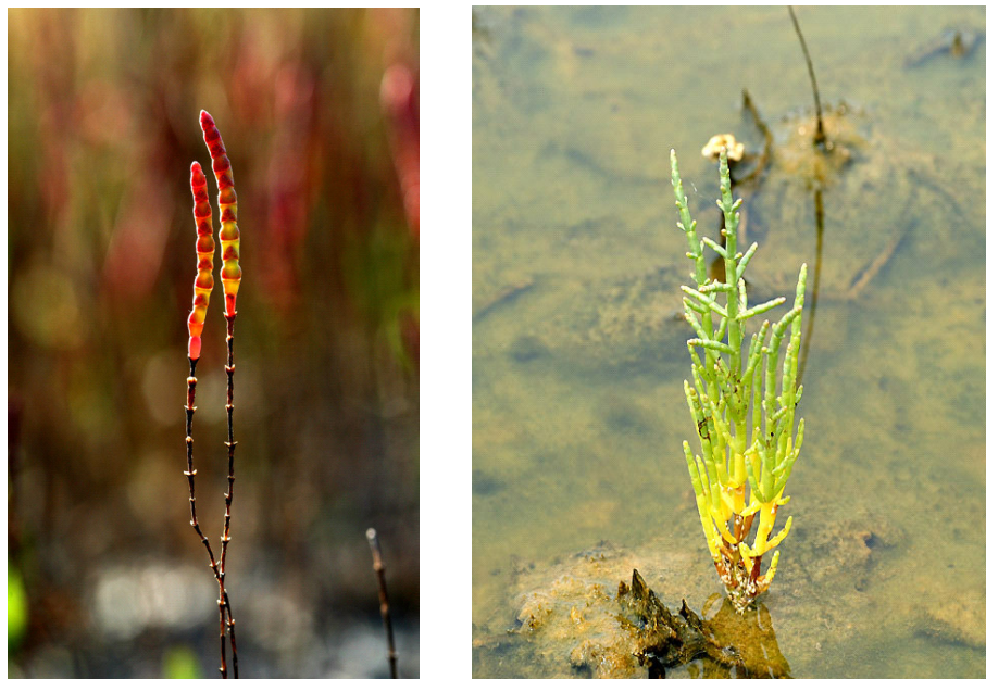
Figure 1. Salicornia herbacea L..

medicinal plant due to the advent of new functional and biological active material. However, review and systemic analysis of botany, chemistry and pharmacology of Sarconia herbacea have not been reported yet. This review intended to provide the currently available information on traditional and local knowledge, ethno biological and ethno medicinal issues, identification of pharmacologically important molecules, and pharmacological studies on this useful plant.