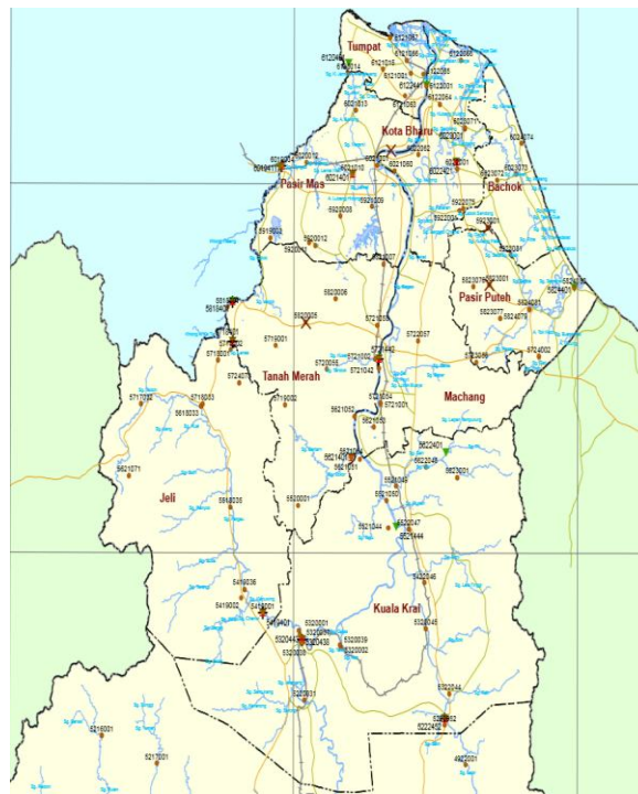
Fig. 4. Map of the Sungai Kelantan

It this paper, we currently focus on developing a flood prediction model in the proposed crisis- mapping as the early stage of our study. We initially used sensory data collected from the authority of flood management. The experiment for the flood prediction model is based on the flood event in Kelantan state of Peninsular Malaysia. Sungai Kelantan base station is chosen as a case study for generating the flood prediction model as the basin of Sungai Kelantan are highly populated. The sensors are located at the observed stations of Sungai Kelantan and inputs from specifically two stations, which are Lebri and Sokok stations, are used to predict river level at Sungai Kelantan as shown in Fig. 4. The input parameters are based on the river levels and rainfall data.