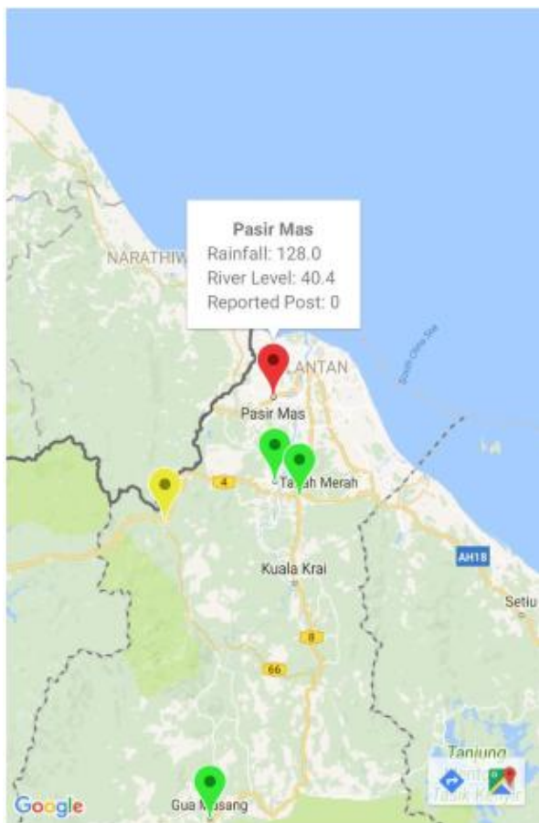
Fig. 5. Flood Application

By creating an app, to map with markers, we produce a map that shows the location of the sensors or the target location with the threshold value for tweets collected in flood domain. We use three distinct colors for the marker to differentiate the flood prediction which is green, yellow and red, which represents low chance, medium chance and a high chance of flood respectively as shown in Fig. 5.