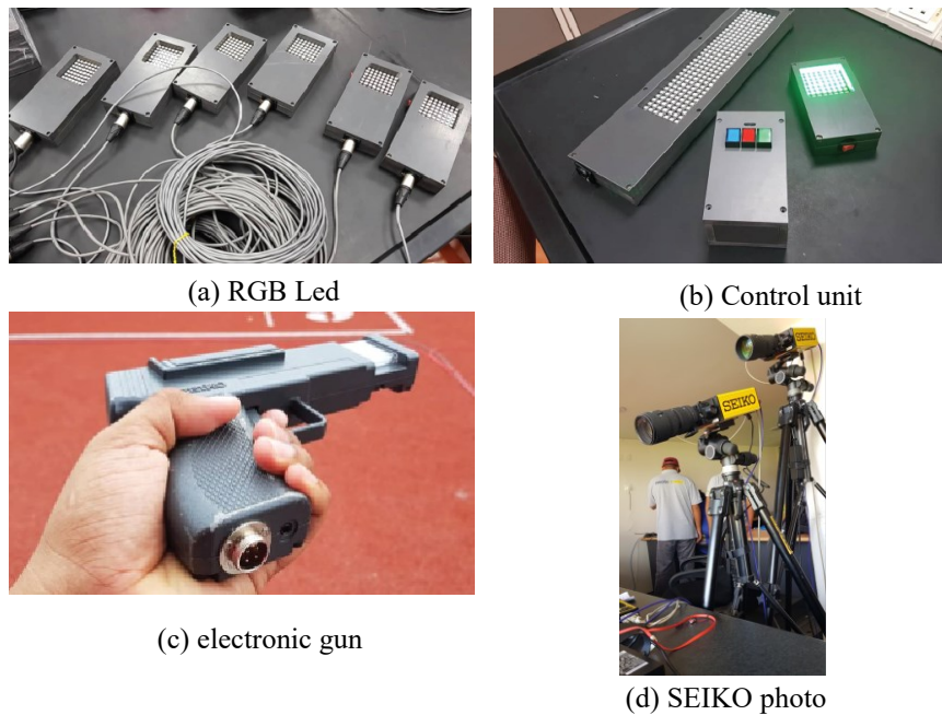
Figure 2: Visual signal device hardware system