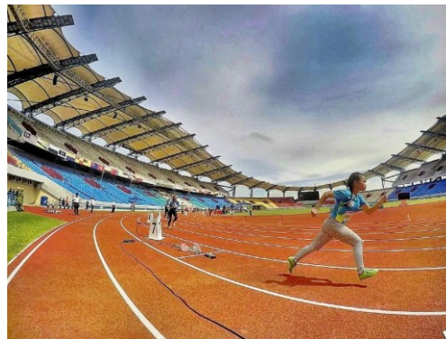
Figure 1: The athlete participated in the track event during SOPMA 2018. [12]

Malaysia Deaf Games, SOPMA [10] is multi-sporting event competition dedicated to the deaf in Malaysia. SOPMA has been around since 1985 under the name of the Deaf Inter-Club Sports Championship (KSAKP). Its held once every two years and is the most important and popular deaf sport because through SOPMA talented deaf athletes will be selected to represent Malaysia in international deaf sports such as the Asia Pacific Deaf Games and the Deaflympic Games. The event of SOPMA were run for six-day games where all 14 states will be participated in the games to compete in four sports events: Athletics, Bowling, Badminton and Football. Each state will take a turn to host the next Games and usually 60-2500 athletes and officers will be participated in SOPMA [11]. In 2018, SOPMA was held in Ipoh, Perak. Total deaf athlete participates in the sports for deaf competition since 1985 is 8605 persons [10].