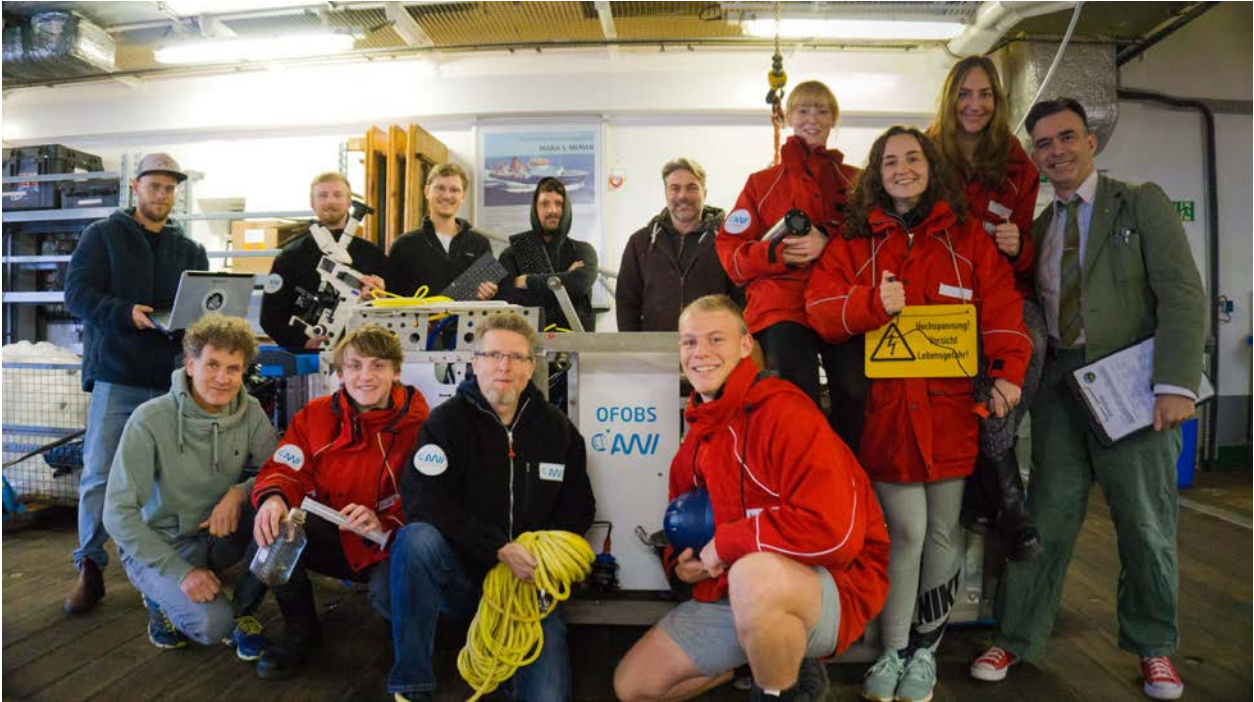
Scientific crew participants of the MSM95 expedition