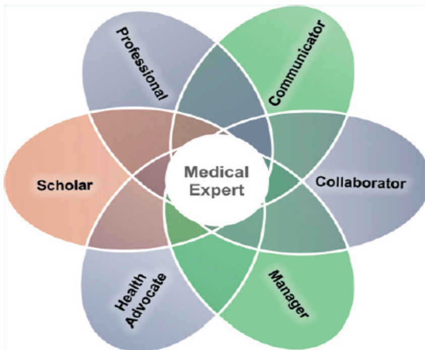
FIGURE 2. The CanMEDs framework comprising seven key competencies required of a doctor to provide high quality care (Aggarwal et al. 2010)