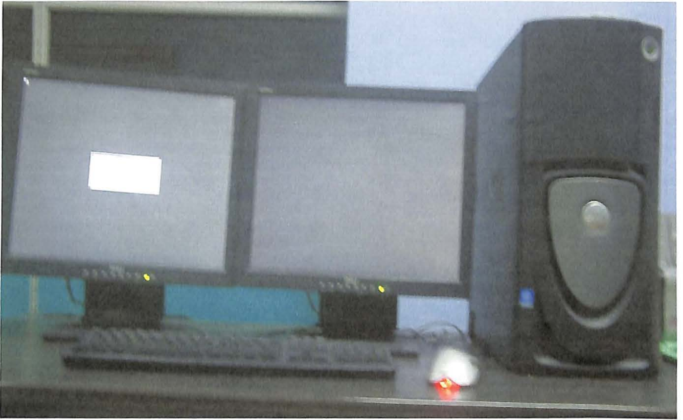
Figure 3: Review workstation