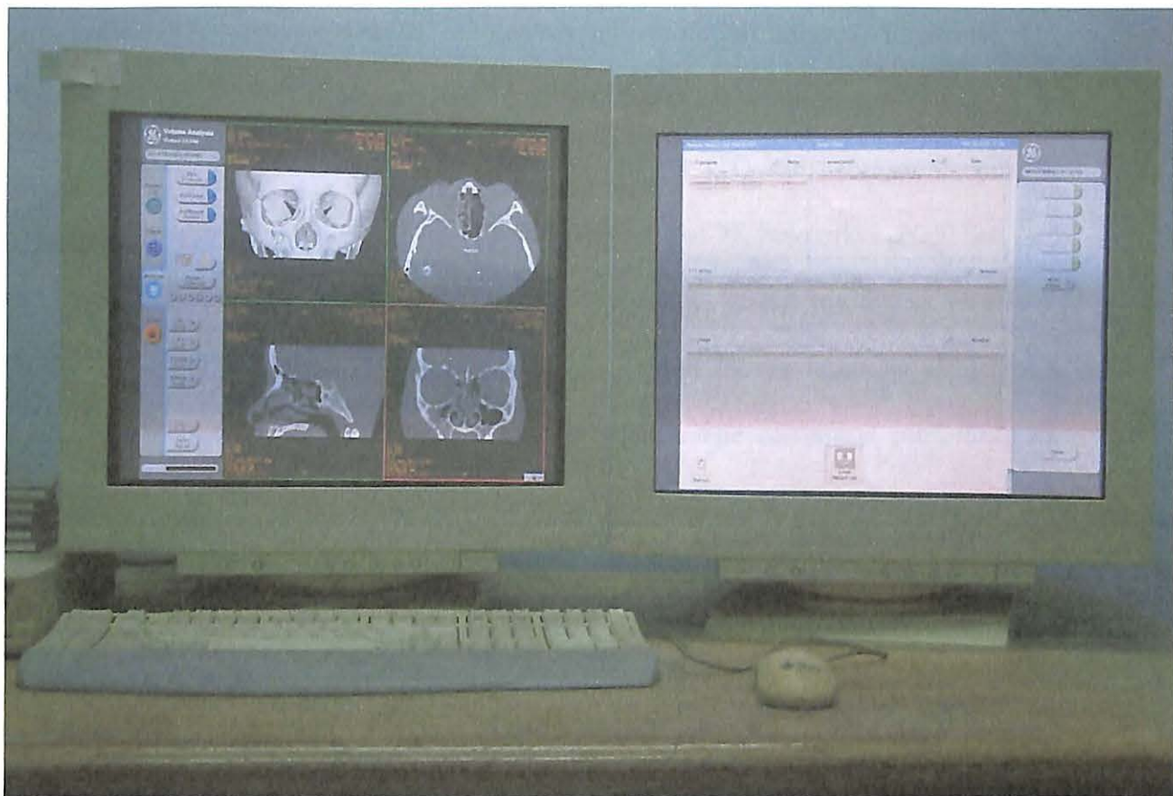
Figure 4: Analysis workstation.