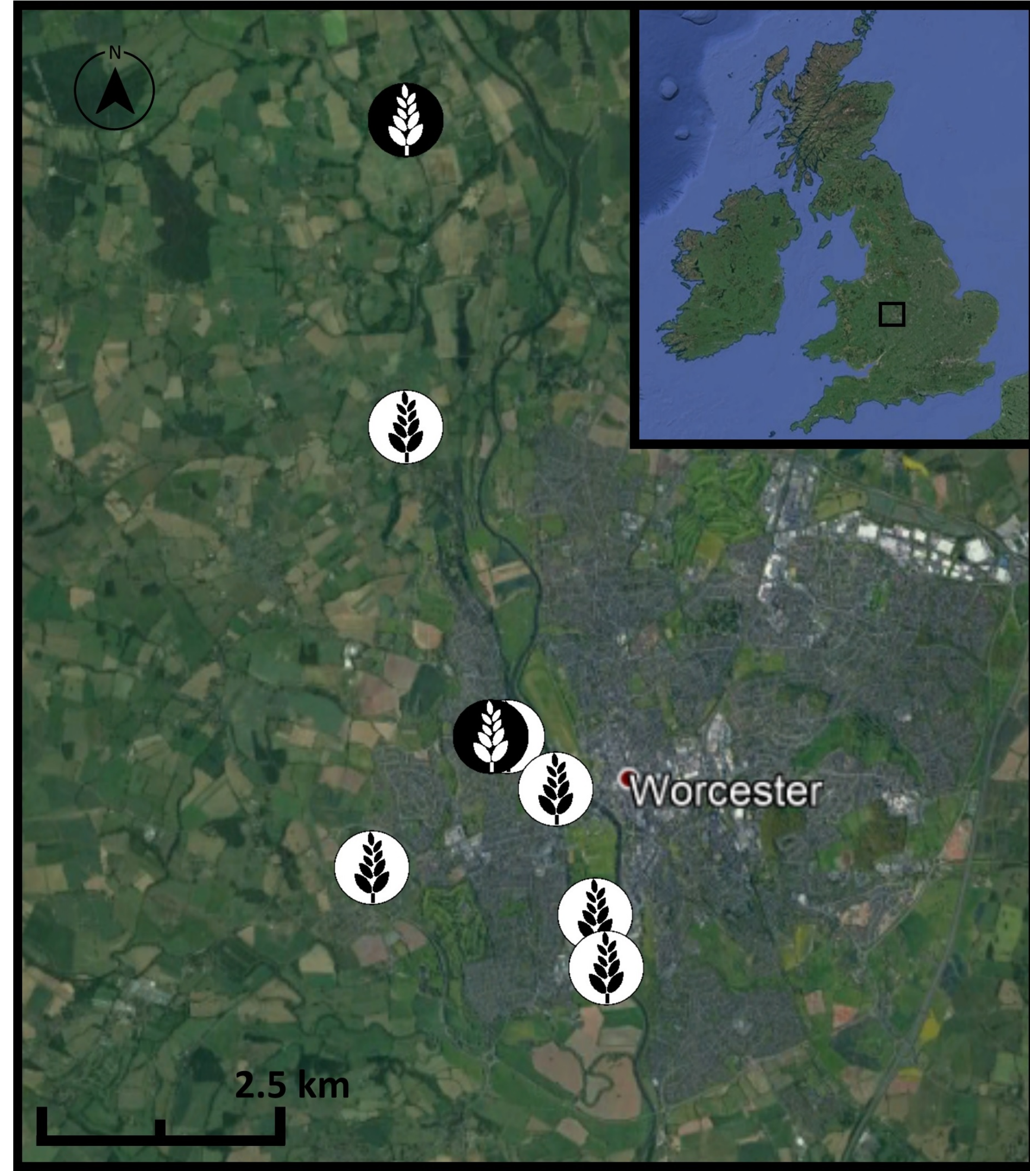
Fig. 1. Map over the Worcester region in the UK 7 . Primary populations are in black and secondary in white.

Eight Dactylis glomerata populations were investigated in 2018 for demographic variation in the flowering progression (Fig. 1.). The populations were chosen to include minimum 150 individual tillers and away from road verges. The flowering progression was investigated using the BBCH-scale 6 with focus on the extrusion of anthers from each tiller. Each tiller was assigned P0 (pre-flowering) until first visible anther. Each tiller was then assigned P1 to P4 based on fractions of extruded anthers in the intervals of 25% (i.e. 0 to 25%, 26 to 50% etc.). The full flowering phase (75% to 100%) was actualized as P4. Each tiller was assigned P5 (end of flowering) when the last anther was detached.