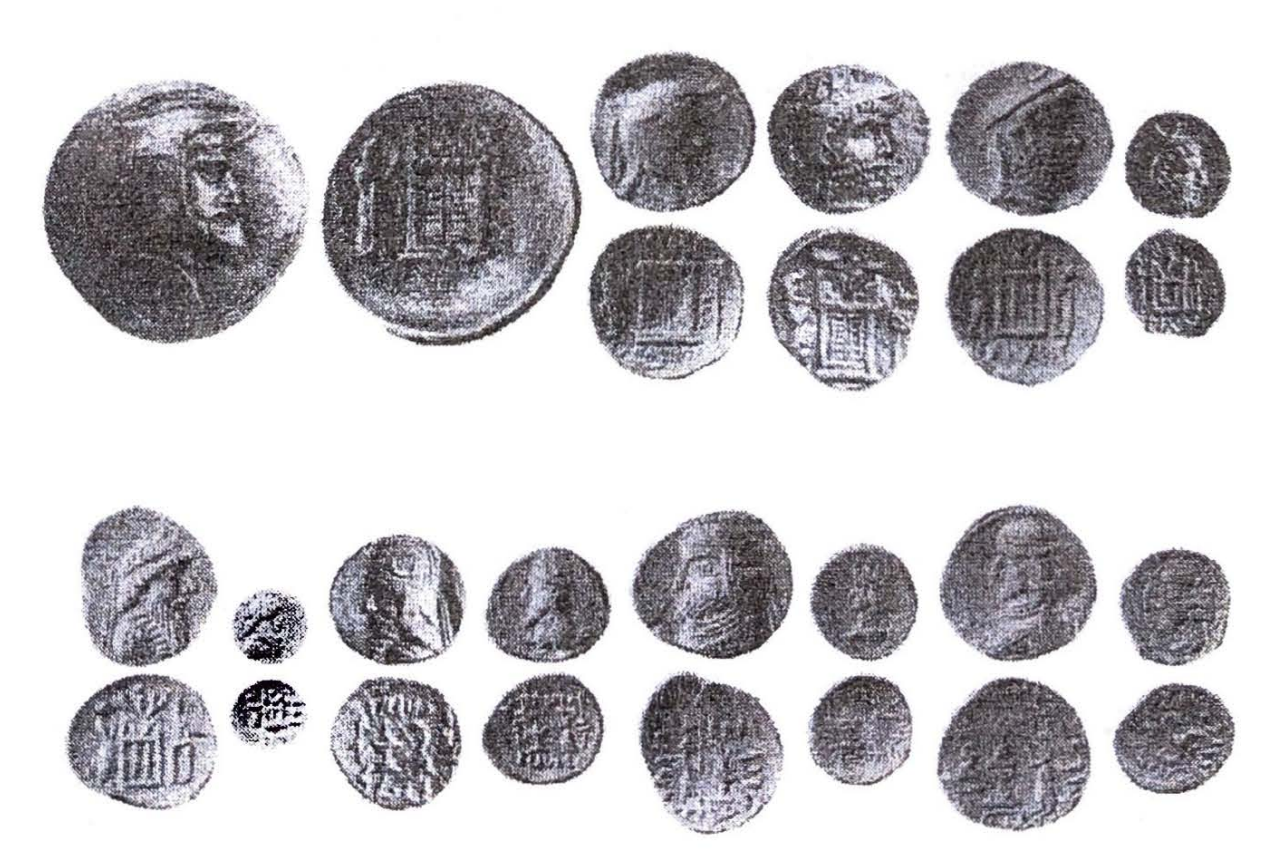
Plate II Vahuberz and Other Rulers