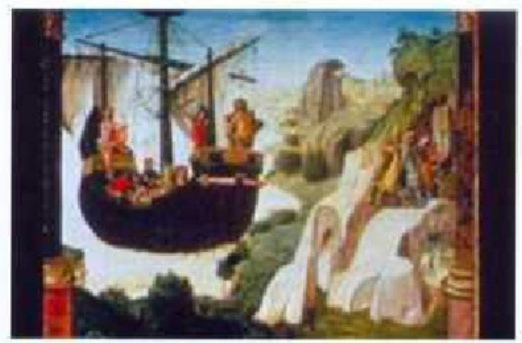
La spedizione degli Argonauti (L. Costa)