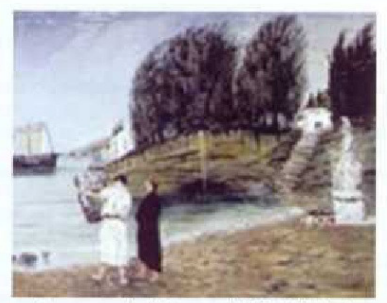
La partenza degli Argonauti (G. De Chirico)