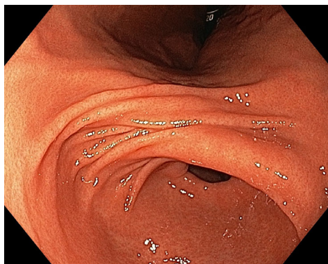
Figure 3 Endoscopic view of a non-atrophic mucosa at the level of the gastric angle.

parameters for the prediction of H. pylori infection. Additionally, a subgroup analysis of patients who were not on proton-pump-inhibitors (PPI; n = 95 ) was performed, also using a two-by-two table as described above. Furthermore, an assumption of H. pylori prevalence rate in an adult German population of about 40% was used. 10,11 Additionally, sensitivity and specificity values of 90% for the gold standard (histology/urease test) were assumed because of literature reports which have shown these values to be in a range between 80% and 98%. 11 As such, calculations using an assumption of a conditional independence and known sensitivities and specificities of the reference standard using a frequentist maximum likelihood method were performed. 12