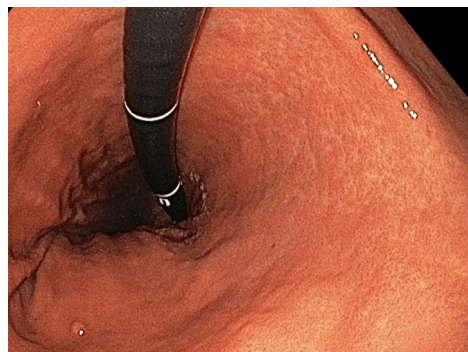
Figure 4 Endoscopic view of atrophic gastric mucosa; the level of atrophy involves majority of the lesser curvature.

A TOTAL OF 200 examinations (119 male, 81 female) were included in the study. Median age of patients was 72 years with a range between 21 and 98 years. Overall, 73