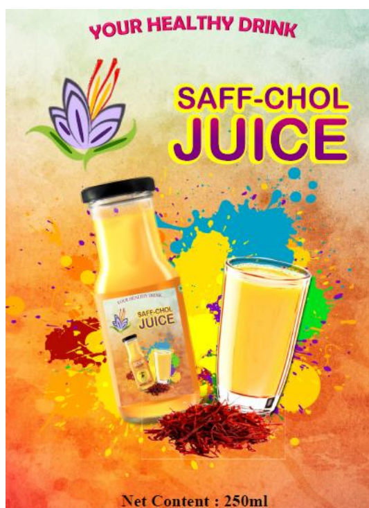
Fig. 1 Poster of Saff-Chol Juice

eNOS: endothelial nitric oxide synthase; DCFHDA: 2',7'-Dichlorofluorescein diacetate, IL: interleukin; NF-κB: nuclear factor-kappa beta, sICAM-1: soluble intercellular adhesion molecule-1, sVCAM-1: soluble vascular cell adhesion molecule-1.