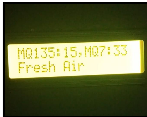
Fig. 2: LCD Reading

The Fig. showed the value of gas that have been detected by sensor and has been displayed on LCD. The LCD shows the concentration of gas in good condition. So people can breathe air safely.