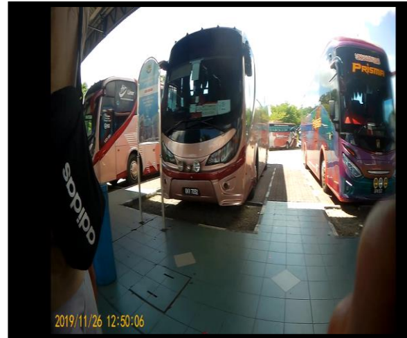
Fig. 4: Terminal Bus Pasir Gudang

Based on Fig. 3 and Fig. 4, the value of gas was detected at bus area. The value was increased because of the sensor detect gases from vehicles around the bus station. Based on results, the reading of Carbon Monoxide (CO) is 39 PPM and this reading can be monitored by using Blynk application.