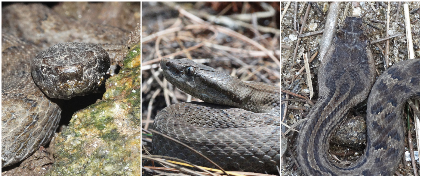
Fig. 3. Heads of Himalayan Pitvipers ( Gloydius himalayanus ) from the Doda District of Jammu and Kashmir, India: frontal (left), lateral (center), and dorsal (right) views.

Generally lethargic, snakes responded to threats by attempting to flee or, if cornered, by coiling and sometimes shaking their tails. Although tail waving is used by some