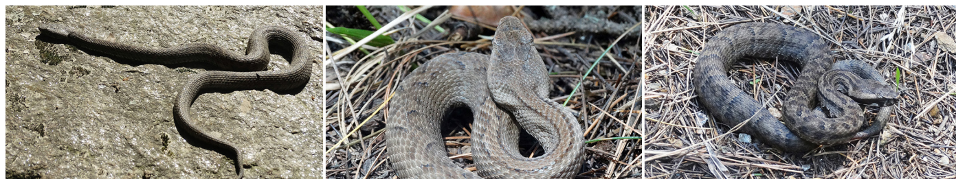
Fig. 2. Himalayan Pitvipers ( Gloydius himalayanus ) from the Doda District of Jammu and Kashmir, India. The most frequently encountered color and pattern with no sign of separation between prefrontal and frontal scales (left), an unusually patterned snake with a small scale separating the prefrontal and frontal scales (center), and a darker individual (right).

Snakes were primarily nocturnal but sometimes basked during the day in close proximity to refugia in rock crevices and under rocks, logs, and other debris near streams, in open forests, and agricultural fields. I observed snakes taking skins and small birds. Khan and Tasnim (1986) provided similar descriptions of habitat use and diet.