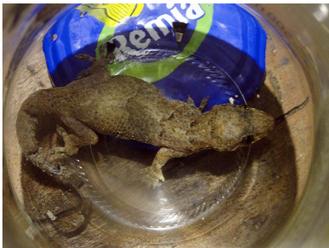
Fig. 4. The earliest record of a Cuban Tropical House Gecko ( Hemidactylus mabouia ) with pterygosomatid mites ( Geckobia hemidactyli ) photographed in 2016 in a family apartment in Corralillo, Villa Clara Province. Note the orange mites on the shoulder and in the axilla.