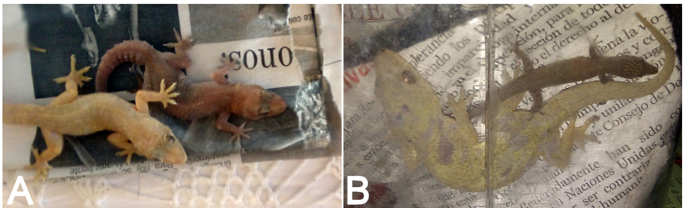
Fig. 3. Tests of interspecific transmission of mites ( Geckobia hemidactyli ) by contact in confinement with infected Tropical House Geckos ( Hemidactylus mabouia ) over a period of 10 days: (A) A West African House Gecko ( Hemidactylus angulatus ) (darker gecko) and (B) an Ashy Geckoleet ( Sphaerodactylus elegans ) (small gecko). Note that the Tropical House Gecko in B was collected with dorsal skin lesions and a loss of scales not related to the mite infection.

After the tests, animals showed no signs of suffering or stress attributable to the restricted environment or the presence of the other individuals. Neither interspecific test resulted in the transmission of mites; the Tropical House Geckos still had Geckobia mites, but both the West African House Geckos and the Ashy Geckolets remained free of mites. All but one of the intraspecific tests also were negative; we found only one mite that had moved to a previously unin-