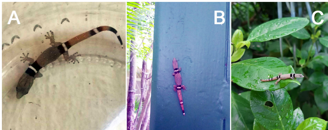
Fig. 1. Central American Collared Geckolets ( Sphaerodactylus glaucus ) from the Ecoarceological Park Xcaret, Municipality of Solidaridad, Quintana Roo, Mexico (A) and from Park Xel-Há, Municipality of Cozumel, Quintana Roo, Mexico (B & C).

At about 1800 h on 10 March 2019, OCM found a Sphaerodactylus glaucus (Fig. 1B) on a construction pillar in Park Xel-Há (20°19'09.69"N, -87°21'28.12"W; WGS 84; elev. 5 m), Municipality of Cozumel, Quintana Roo, Mexico. The gecko was not captured, but we deposited a photographic voucher in the herpetological collection of the Natural History Museum of Los Angeles (LACM PC 2473). Subsequently, at