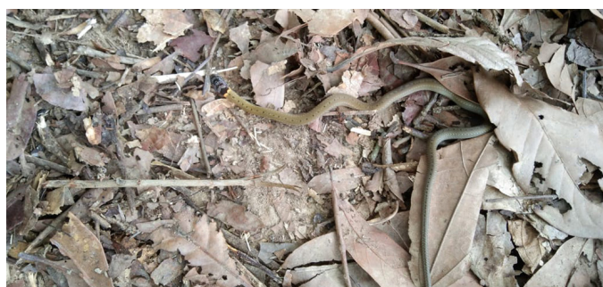
Fig. 1. A Collared Black-headed Snake ( Sibynophis collaris ) from Jamchiori Village, Nihongchari, Bandarban, Bangladesh.

On 12 May 2020, we found an adult (total length ~90 cm) Collared Black-headed Snake ( Sibynophis collaris ) (Fig. 1) in Jamchiori Village, Nihongchari, Bandarban, Bangladesh (21°25'37.1"N, 92°10'50.8"E) (Fig. 2). We identified the snake based on descriptions in Hasan et al. (2014) and Khan (2018). The habitat in the area is mixed evergreen forest. Although this new record is approximately 470 km south of previously known locations in Bangladesh, populations of this species likely exist in forested habitats in intervening areas.