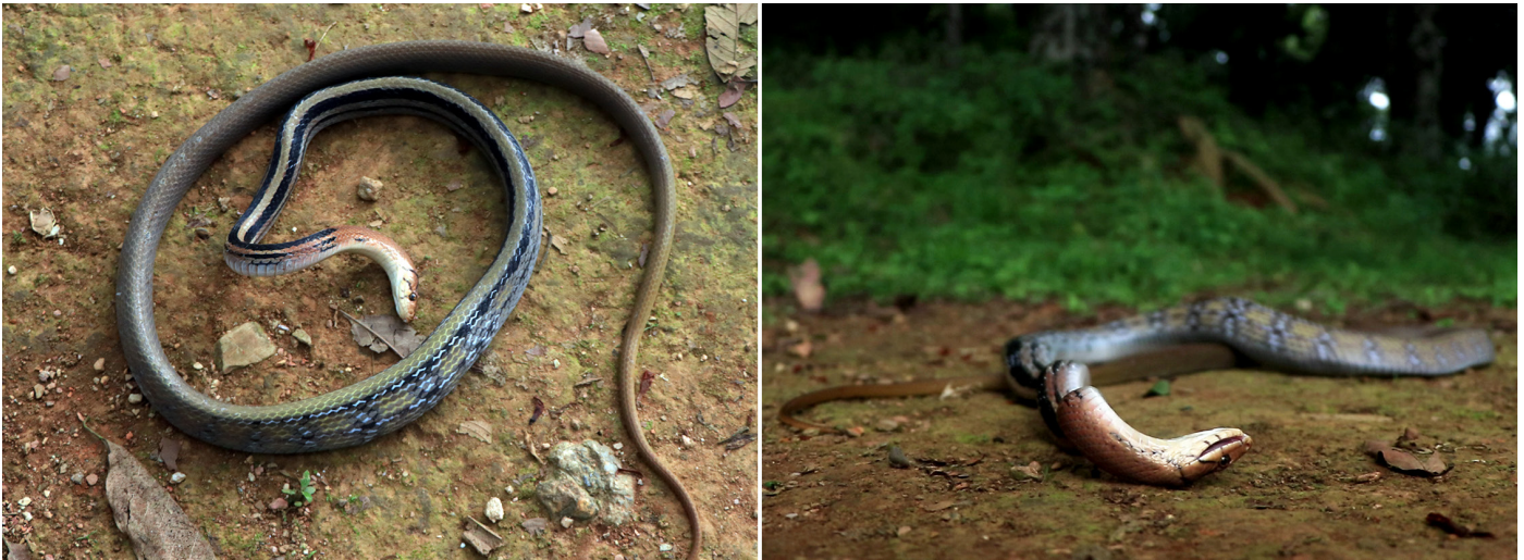
Fig. 2. A Copper-headed Trinket Snake ( Coelognathus radiatus ) death-feigning with mouth closed (left) and partially open (right).