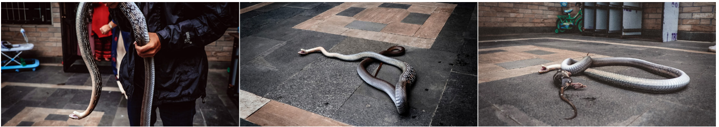
Fig. 3. A Copper-headed Trinket Snake ( Coelognathus radiatus ) feigning death when handled by a rescue team member (left), when placed on the ground (center), and after regurgitating a mouse (right).