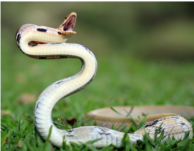
Fig. 4. This Copper-headed Trinket Snake ( Coelognathus radiatus ) assumed an elevated S-shaped posture and gaped prior to feigning death.

83°57'7.55"E; 747 m asl). While being released, this snake elevated its head, gaped, and assumed an S-shaped posture (Fig. 4) but subsequently became motionless with the mouth