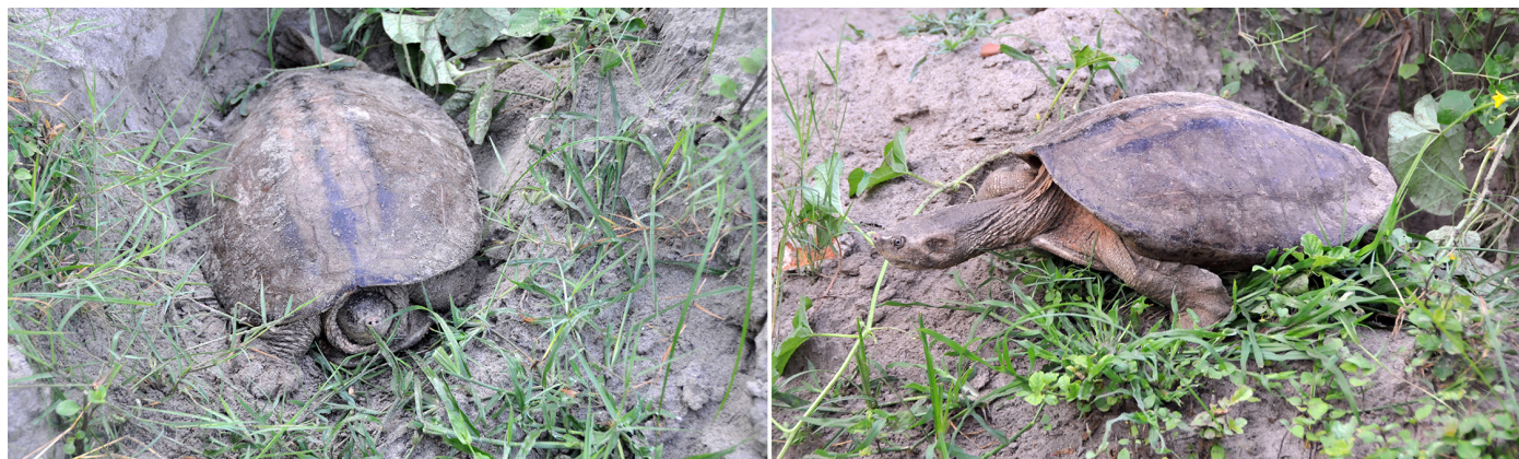
Fig. 1. A Three-striped Roofed Turtle ( Batagur dhongoka ) on the bank of the Yamuna River, Delhi, India.