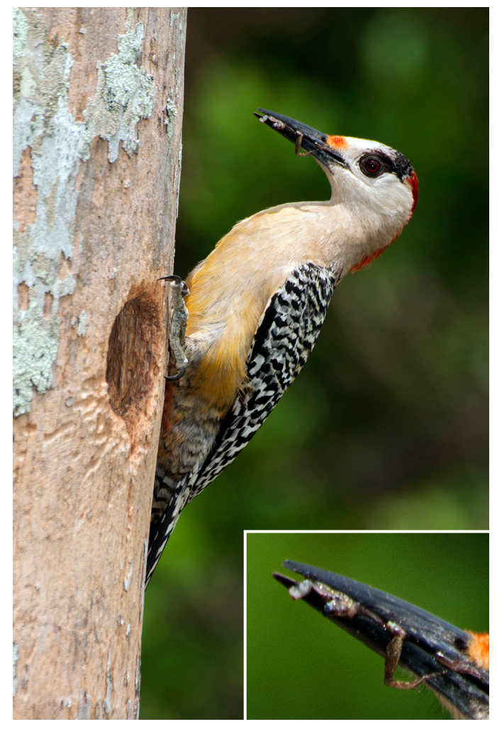
Fig. 3. A female West Indian Woodpecker ( Melanerpes superciliaris ) carrying an individual of an unidentified species of Eleutherodactylus to its nest near the Santa Cruz River, Artemisa Province, in May 2013.

At 2110 h on 7 October 2011, we found an adult (unsexed) Broad-banded Trope, Tropidophis feicki (412 mm SVL, 41 mm tail length) in the "Orquideario de Soroa" Botanical Garden, Candelaria, Artemisa Province