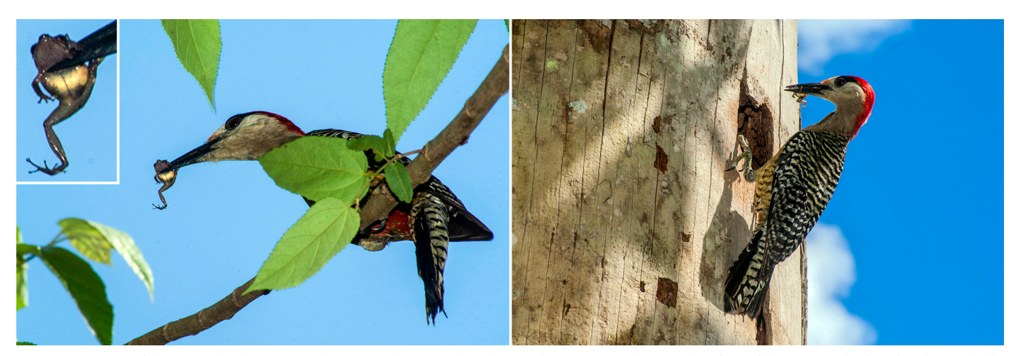
Fig. 2. Sequence of photographs showing a male West Indian Woodpecker ( Melanerpes superciliaris ) with a frog of the genus Eleutherodactylus , probably a Pinar del Río Bromeliad Frog ( E. olibrus ) (left), carried to its nest (right) near the Santa Cruz River, Artemisa Province, in June 2010.

Between 2010 and 2013, we recorded three different instances of predation by West Indian Woodpeckers (Melanerpes superciliaris) on frogs of the genus Eleutherodactylus near the Santa Cruz River, San Cristóbal, Artemisa Province. In all instances the parent woodpeckers were carrying food to their chicks in cavity nests in palm tree trunks (Roystonea regia). At 1730 h on 21 April 2010, we observed a male woodpecker carrying an individual of an unidentified species of Eleutherodactylus to its nest (Fig. 1) in a palm tree about 140 m from the river (22°45'25.0", -83°08'56.0"; 220 m asl). At 1100 h on 3 June 2010, we observed a second case involving a male woodpecker carrying a frog of the genus Eleutherodactylus, probably a Pinar del Río Bromeliad Frog (E. olibrus; Fig. 2), to its nest in a different palm tree very close to the first one and adjacent to a patch of secondary forest. At 1110 h on 27 May 2013, we observed a female woodpecker carrying an individual of an unidentified species of Eleutherodactylus to its nest (Fig. 3) in a third palm tree about 350 m southeast of the other two observations and about 225 m from the river (22°45'14.1", -83°08'50.8"; 270 m asl). The vegetation in the area is composed mostly of secondary grasslands, secondary groves, and semideciduous forest, although the three nests were in isolated palm trees in secondary grassland with scattered bushes.