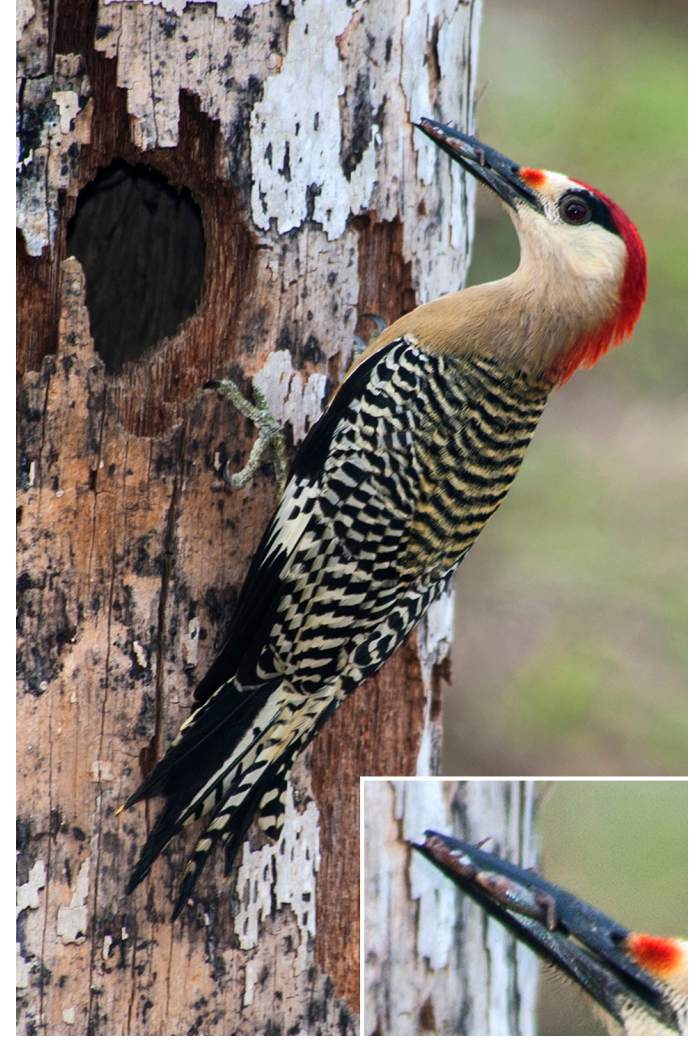
Fig. 1. A male West Indian Woodpecker ( Melanerpes superciliaris ) carrying an individual of an unidentified species of Eleutherodactylus to its nest near the Santa Cruz River, Artemisa Province, in April 2010.