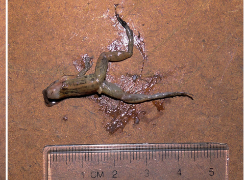
Fig. 4. A juvenile Spotted Brown Trope ( Tropidophis pardalis ) found in the backyard of the Facultad de Biología, Universidad de La Habana (left), with a partially digested Cuban Flat-headed Frog ( Eleutherodactylus planirostris ) freshly regurgitated (center), and a detail of the prey item (right).