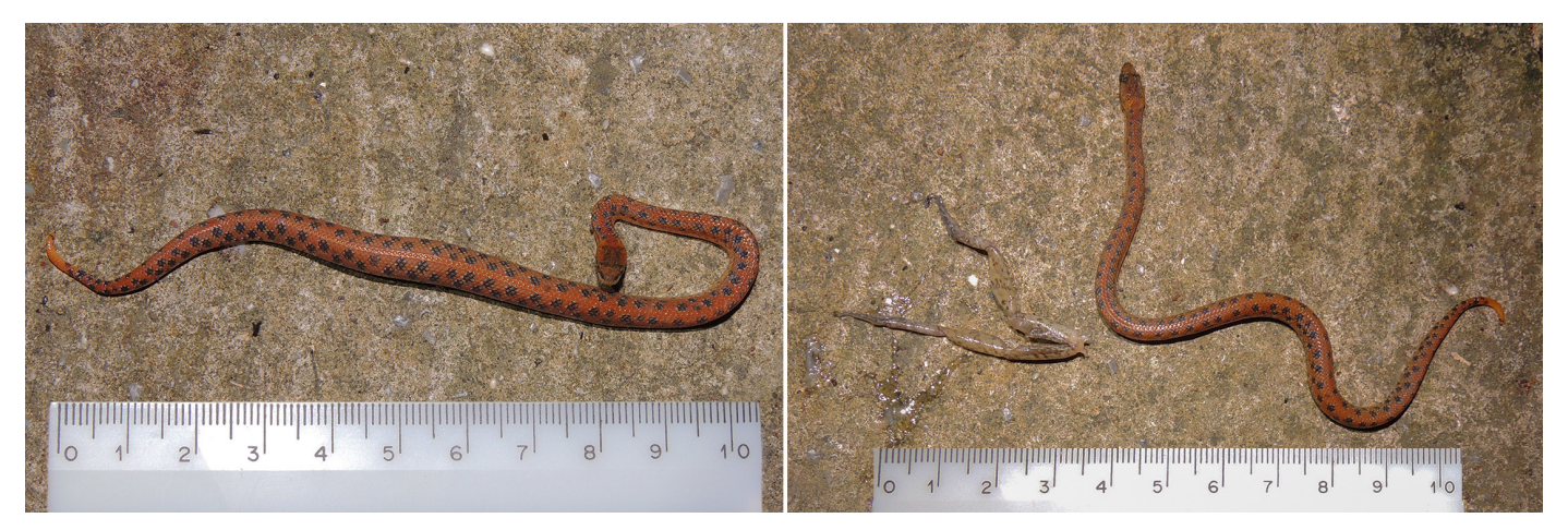
Fig. 5. A juvenile Spotted Red Trope ( Tropidophis maculatus ) found near the field station in the "Sierra del Rosario" in the Biosphere Reserve at Las Terrazas, Artemisa Province (left), with a partially digested, freshly regurgitated Guaniguanico Yellow-mottled Frog ( Eleutherodactylus goini ) (right).

mm tail length; Fig. 6) at La Sabina Field Station, "Lomas de Banao" Ecological Reserve, Guamuhaya Massif, Sancti Spíritus Province (21°52'59.3", -79°35'55.3"; 620 m asl). It was placed in a container for a further session of photographs and the next day it had regurgitated a partially digested Cuban Flat-headed Frog (ca. 18 mm SVL) that had been ingested head first. The predominant vegetation around the field station is largely secondary pinewoods and evergreen mesophyllous forest.