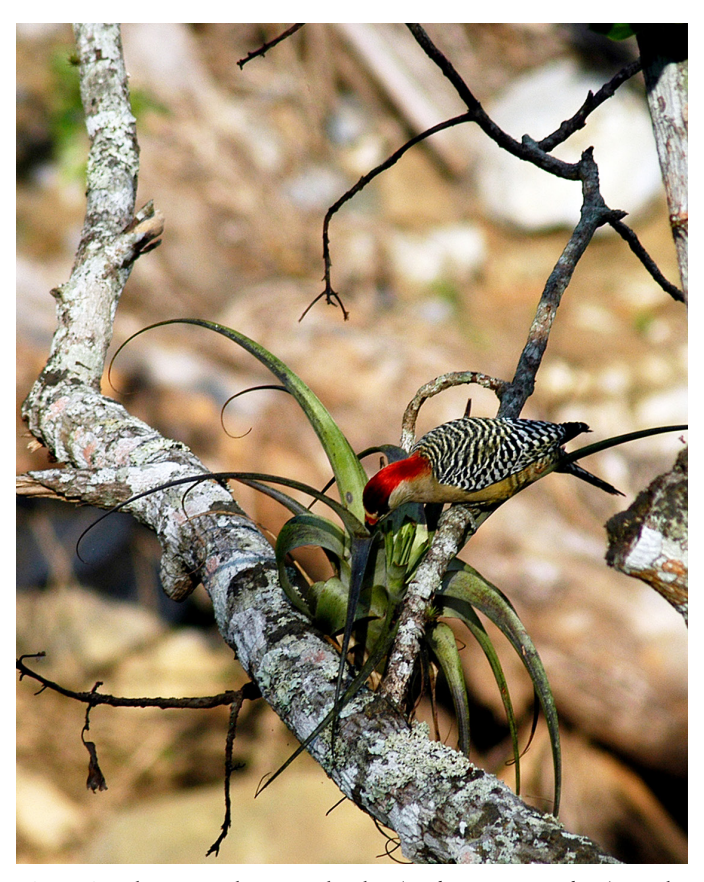
Fig. 8. A male West Indian Woodpecker ( Melanerpes superciliaris ) searching for prey inside a bromeliad at the Santa Cruz River.

and Alonso 2003b; Garrido and Kirkconnell 2011). Frogs and lizards have been reported also in the diet of the Cuban Green Woodpecker, Xiphidiopicus percussus (Garrido and Kirkconnell 2011). Many species of woodpeckers, including those that are mostly frugivorous, increase the rate of predation on invertebrates and even on small vertebrates during the breeding season, apparently in order to provide the growing nestlings with protein-rich food (see del Hoyo et al. 2002 for a review; also Ojeda and Chazarreta 2006; Koenig et al. 2008; Vukovich and Kilgo 2019). Kirkconnell (2000) observed that 51% and 40% of items carried to nestlings by male and female West Indian Woodpeckers, respectively, were of animal origin, but he did not offer details on the taxonomic identity of the prey. Villard and Pavis (1998) noted that Martinique Frogs (E. martinicensis) represented 11% of the animal prey items (n = 248) fed to nestlings by Guadeloupe Woodpeckers (M. herminieri).