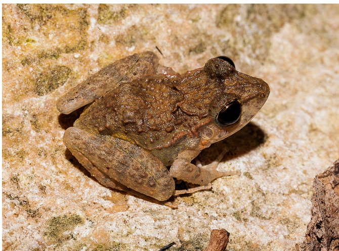
Fig. 6. Adult Cuban Streamside Frog ( Eleutherodactylus riparius ) from the Sierra del Rosario in western Cuba.

Schwartz and Ogren (1956) mentioned that most of the Caribbean Watersnakes they collected in Granma Province were in quiet areas of streams with their bodies looped around rocks on the bottom close to the banks at night (see also Barbour and Ramsden 1919). In rivers and streams in the Guaniguanico Range in western Cuba and the Guamuhaya Range in central Cuba, we have repeatedly observed this snake patrolling shallow waters (<30 cm deep) close to riverbanks at night. In such situations, poeciliids are frequently motionless on the bottom, especially species of Girardinus , as species of Gambusia tend to remain close to the surface even at night (T.M. Rodríguez-Cabrera, pers. obs.). Those observations suggest that the species may be an active forager, although apparently it also uses an ambush strategy (see Results).