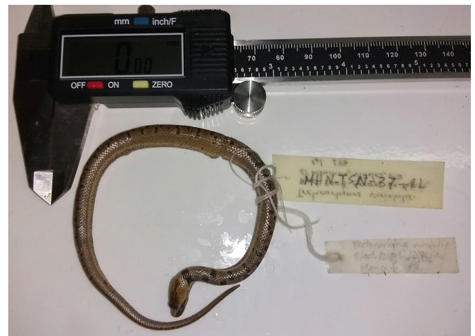
Fig. 3. Juvenile Caribbean Watersnake ( Tretanorhinus variabilis ; MHN.TSN-37-CL) collected at La Yabita Stream, El Moncada, Viñales Municipality, Pinar del Río Province, containing two partially digested Cuban Streamside Frogs ( Eleutherodactylus riparius ) in its stomach.