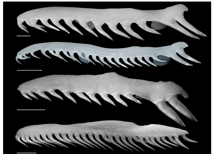
Fig. 7. Comparison of the left maxillae of the four genera of dipsadid snakes present in Cuba. From top to bottom: Cuban Racer ( Cubophis cantherigerus ), Cuban Lesser Racer ( Caraiiba andreae ), Havana Racerlet ( Arrhyton dolichura ), and Caribbean Watersnake ( Tretanorhinus variabilis ). Note the strong opisthognathous condition in all genera except Tretanorhinus , which has dentition typical of a piscivorous snake. Scale bars = 1 mm.