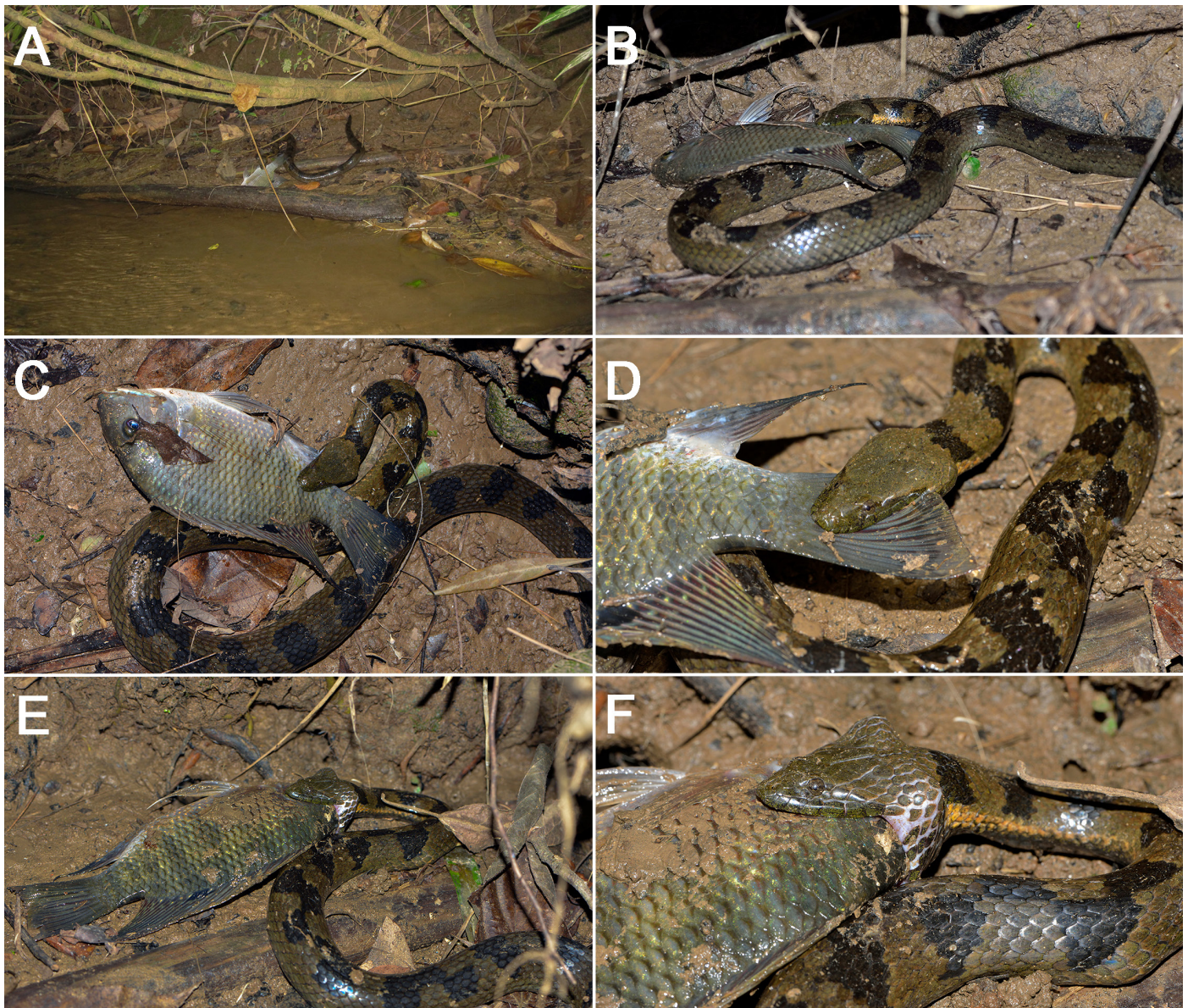
Fig. 4. Sequence of photographs of a predation attempt by a Caribbean Watersnake ( Tretanorhinus variabilis ) on an introduced Blue Tilapia ( Oreochromis aureus ) in the San Marcos River: (A) At the moment the snake pulled the fish out of the water; (B–C) holding the fish, notice the disproportionate size of the fish; (D) shifting its hold to the fish’s tail, (E) having moved to the head and started swallowing the fish, and (F) the maximum extent of ingestion attained during the attempt to swallow the fish.

At 0900 h on 10 July 2019, we observed an adult male Caribbean Watersnake, T. v. wagleri (ca. 700 mm total length) foraging in the Manantiales River at Soroa, Candelaria Municipality, Artemisa Province (22°47'38"N, 83°00'30"W; 150 m asl; Fig. 2). When first seen the snake