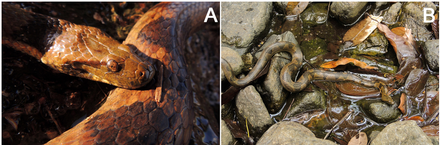
Fig. 1. The Caribbean Watersnake ( Tretanorhinus variabilis ) exhibits some adaptations to an aquatic lifestyle, such as the eyes and nostrils on top of the head (A) and a color pattern that blends well with the riparian environments it inhabits (B).

Cuban Archipelago and one occurs on Grand Cayman, the Cayman Islands (Schwartz and Henderson 1991; Henderson and Powell 2009; Estrada 2012; Rodríguez et al. 2013; Fig. 2). The Caribbean Watersnake, which occurs only in aquatic ecosystems, exhibits some morphological adaptations to an aquatic lifestyle. These include dorsally positioned eyes and nostrils (Barbour and Ramsden 1919; Buide 1985; Fig. 1A) and dark markings on a dark olive ground color that blend perfectly with the leaf litter and algae-covered rocks on the bottom of ponds and streams (Fig. 1B). Those characteristics, however, might be considered just a first stage toward the development of more complex adaptations to an aquatic lifestyle (see Lillywhite 2014 for a review).