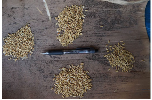
Photo 8. Several local varieties of rice were recognized with different names at every farmer in northern Sagaing Region. They are separately sown and conserved. Photographed at San Ton (Naga name: Nou Him) village, Lahe Township (a waypoint MK048).