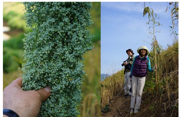
Photo 4. Chenopodium sp. (probably C. giganteum ) grown on a slash-and-burn field was characterized by a large inflorescence (left)(photo was taken at Pa Thon village) and a tall plant height (right)(photo was taken near Lahe).