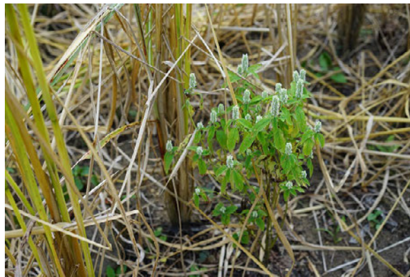
Photo 3. Elsholtzia blanda grown with rice on a slash-and-burn field near Pa Sang village in Hkamti Township (a waypoint MK020 = MK032).