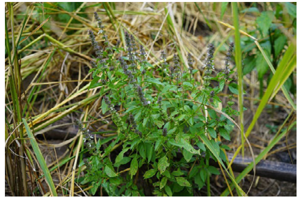
Photo 2. Holy basil grown with rice on a slash-and-burn field near Pa Sang village in Hkamti Township (a waypoint MK024).