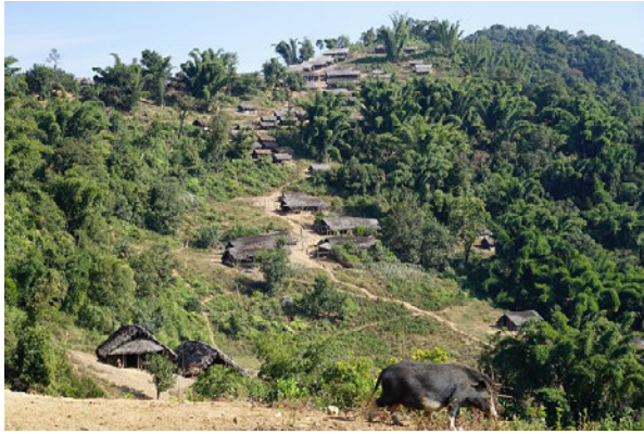
Photo 7. San Ton (Naga name: Nou Him) village is located on a hill top in Lahe Township (a waypoint MK048).