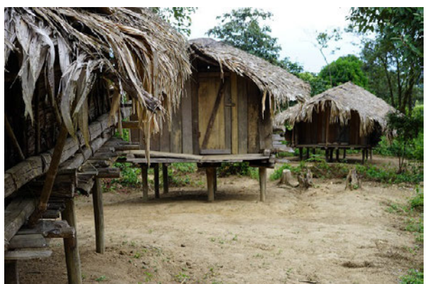
Photo 6. Granaries at Pa Sang village, Hkamti Township (a waypoint MK033).