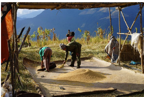
Photo 5. Threshed rice grains are cleaned in a working tent shed at Pa Thon village in Hkamti Township (a waypoint MK024).