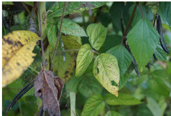
Photo 9. A wild ancestral form of Azuki bean, Vigna angularis var. nipponensis was collected near Lahe town (a waypoint MK059).