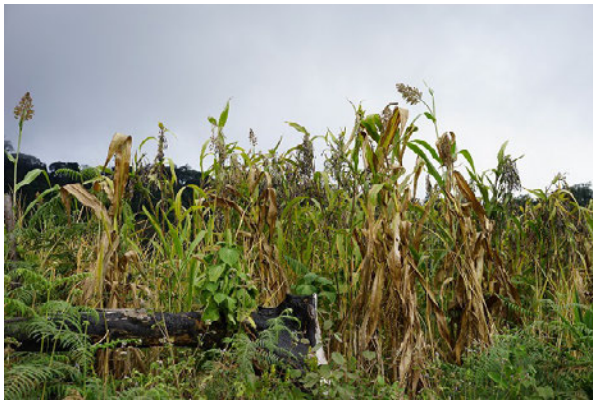
Photo 1. Sorghum, Job's teas, and perilla were grown admixed with rice on a slash-and-burn field near Pa Sang village in Hkamti Township (a waypoint MK020 = MK032).