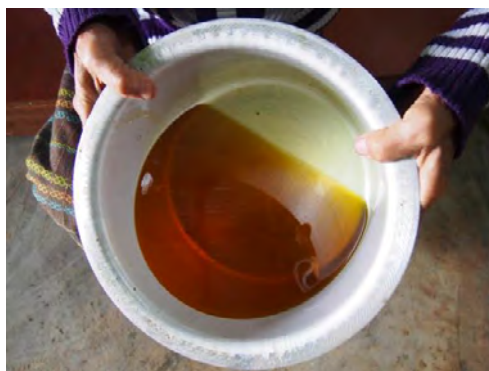
Photo 20. Oil of B. juncea .