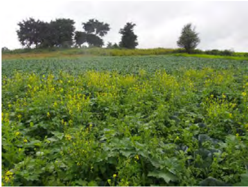
Photo 15. Flowering stage of B. juncea .