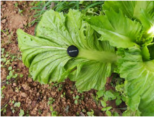
Photo 9. Slightly wide type of petiole or midrib width.