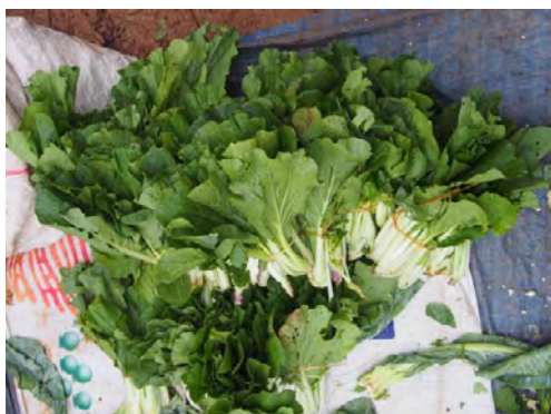
Photo 17. Flesh vegetables of B. juncea .