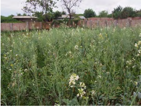
Photo 7. The seed production of Chinese kale.