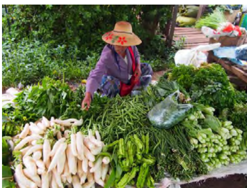
Photo 22. Radish at the market.