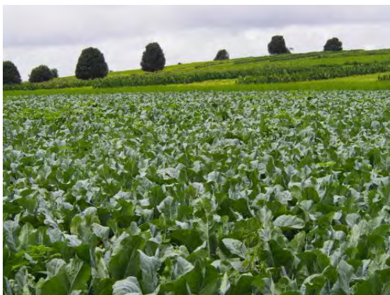
Photo 5. Cauliflower production.