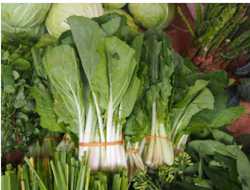
Photo 11. White type of petiole or midrib color.