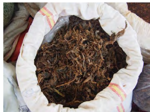
Photo 18. Dry vegetables of B. juncea .