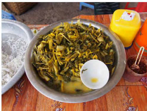
Photo 19. Pickles of B. juncea .