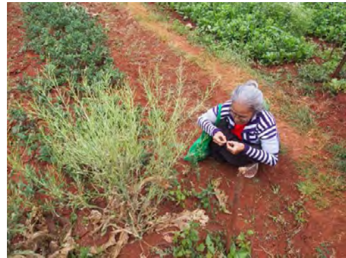
Photo 16. Ripening stage of B. juncea .