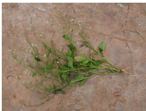
Photo 24. Radish plant for the oilseeds.