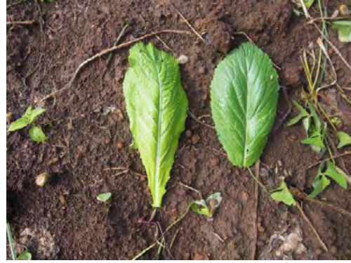
Photo 8. Leaf blade shape in outline (left: spatulate, right: obovate).