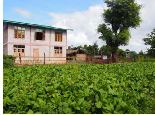
Photo 14. Harvesting stage of B. juncea .