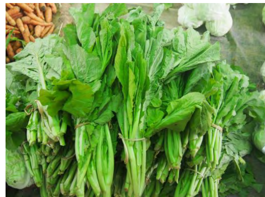
Photo 12. Green type of petiole or midrib color.