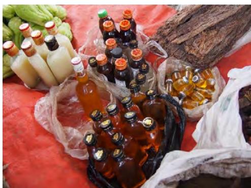
Photo 21. Essential oil for skin of B. juncea .