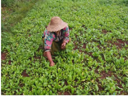
Photo 13. Seedling stage of B. juncea .