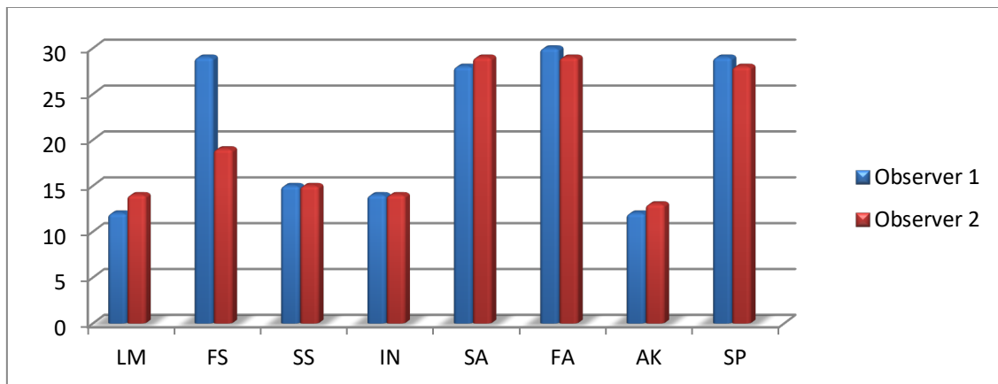
Figure 1. Initial Ability Pre-Test

In this initial assessment, quantitative data were obtained using a rating scale. The results of the observations are then analyzed according to the initial conditions that are owned. There are two dimensions observed, the first was the understanding of hand hygiene, which consists of three items, namely: washing hands before eating, washing hands after eating, washing hands after activities. In this first dimension, the highest score that must be achieved is 16. The result is that SDLB 127710 students do not understand hand hygiene \bar{x}= 9.50 .