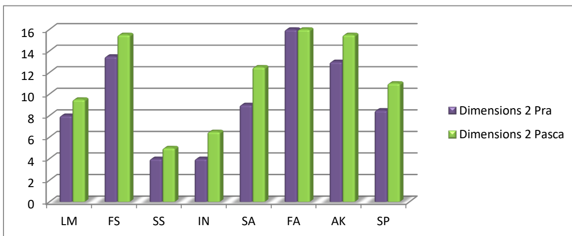
Figure 2. Washing Hands

Washing your hands is a very simple thing that you can start at home. Washing hands before and after meals is fundamental and must be taught. After being given the act of washing their hands properly, mentally retarded children can wash their hands even though the order is always forgotten, but they are excited to wash their hands after, before, and after activities. From the graph (see figure 2) it can be said that there was an increase from pre-research to post-research. Out of eight children three children get very good scores, three children get good scores, and two children get poor scores. Overall, there was an increase from pre-study to post-study.