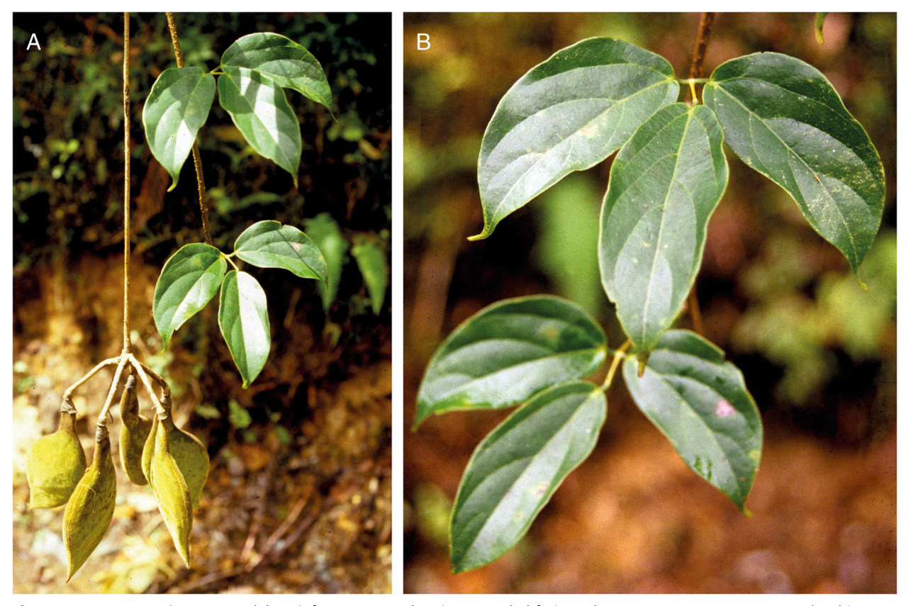
Fig. 2. Mucuna tapantiana. A pendulous infructescence, showing 1-seeded fruits; B leaves. PHOTOS: A. RODRÍGUEZ-INBIO (Rodríguez & Vargas 4382, INB).