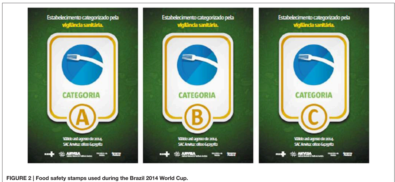
FIGURE 2 | Food safety stamps used during the Brazil 2014 World Cup.

The violation score (mean) was reduced between the assessments. Figure 3 shows a Brazil map indicating the inspection score reduction by considering the mean value presented by food services in each Brazilian State. In general, the States in the South and Southeast had food services with lower scores in the first cycle than the food services from the States in the North, Northeast, and Midwest. However, a more