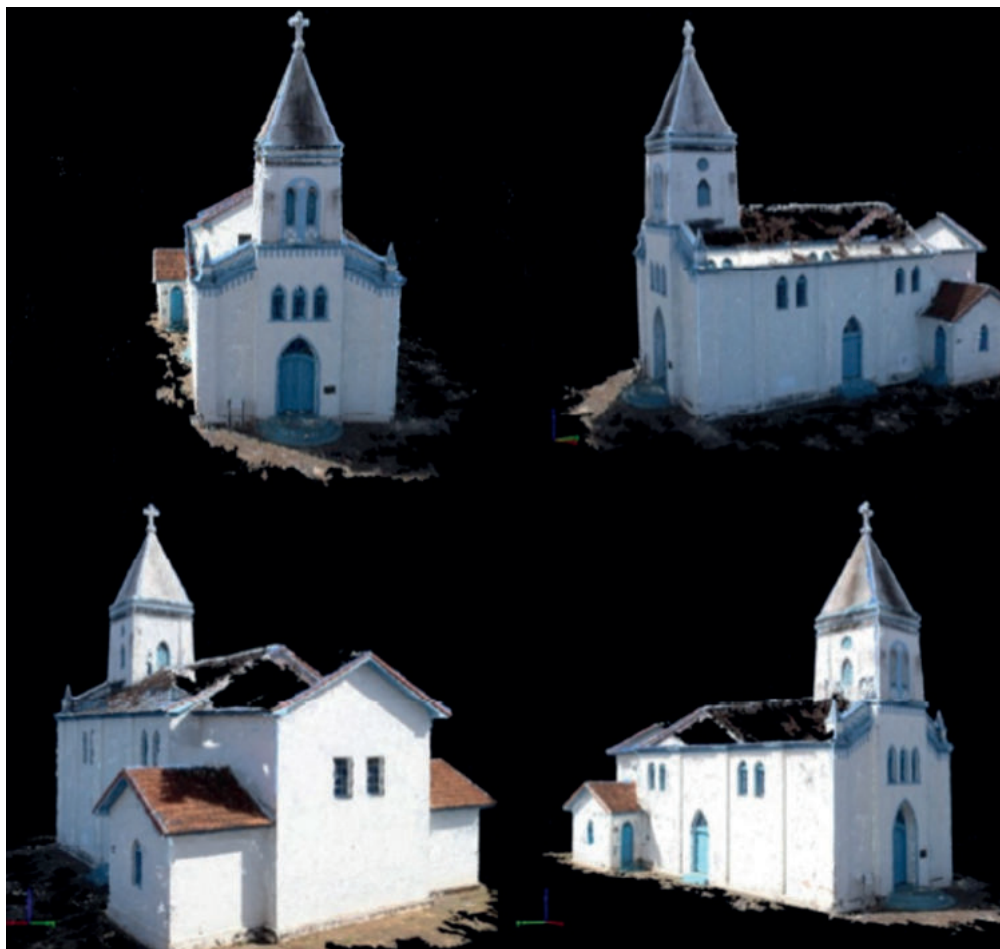
Figure 6 Texturizing 3D model of Nossa Senhora do Rosario Church

history, in encouraging the conservation of architectural heritage and cultural tourism. Usually has a great impact, bringing economic and social changes to the environment.