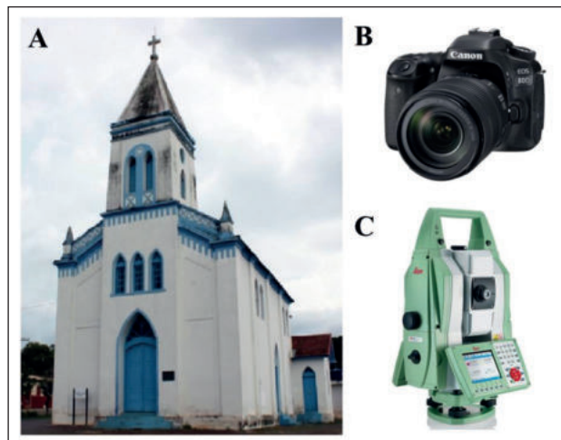
Figure 1 A Nossa Senhora do Rosario Church B Camera Canon 600D C Total Station Leica MS-50 with Laser Scanning

Carmelo, State of Minas Gerais, Brazil. This church was chosen due to its historical, cultural and social importance to the city. The data acquisition for the 3D reconstruction was carried out by using a Canon 600D low-cost digital camera. The reference point cloud for the evaluation of the reconstruction was obtained by a total station Leica MS-50, which is assembled with a laser scanning module.