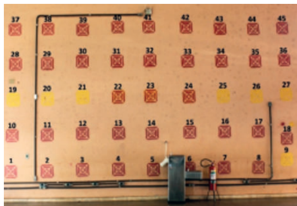
Figure 2 Calibration field adapted on a wall. In total, 45 targets of 0.26 m with a center of 0.02 m 2

For the adjustment of the internal orientation parameters (IOP) of the camera, an auto calibration was performed, being used for this purpose a calibration field according to Figure 2. The coordinates of the field targets were measured using a total station Leica MS-50, considering a local coordinate system.