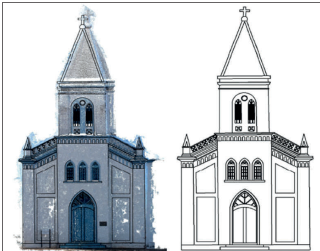
Figure 7 Restitution of the facade of the Church of the Rosary

The results of the photogrammetric survey, in terms of metric variation, were quite satisfactory, in relation to those obtained from the laser scanning, since the difference of distance between clouds was more than 80% below 3.5 cm and around 90% below