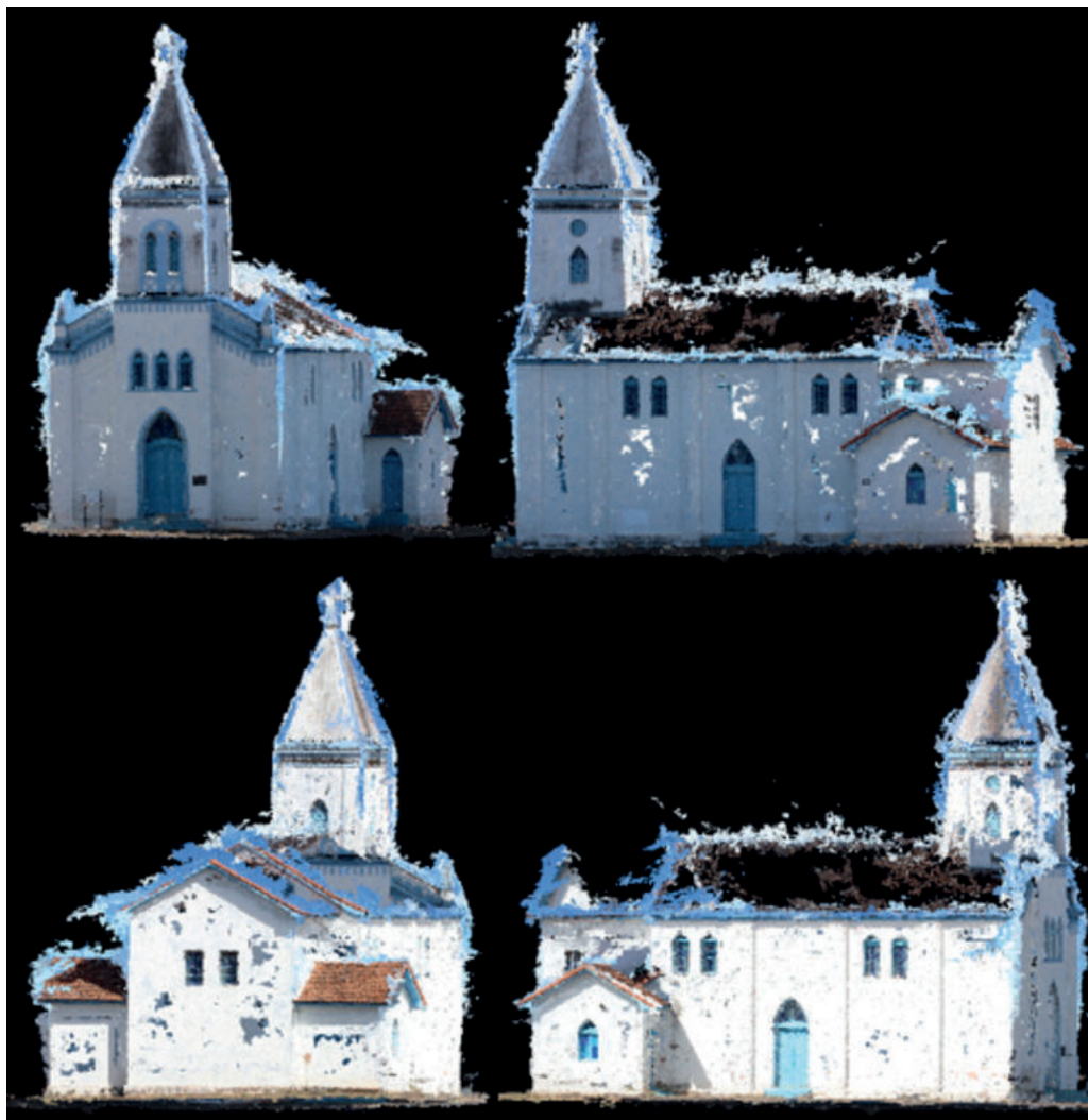
Figure 3 Densified point cloud of the facades of the Nossa Senhora do Rosario Church

generated by laser scanning. It is important to highlight that the data collected by laser scanning refer only to four sides samples of the church, and they were used as a basis for comparison, being restricted to this portion of the representation of the church. This comparison is valid since the results are reliable, although they are subject to intrinsic errors to the total station, such as: no verticality of the main axis, no horizontality of the secondary axis, collimation error, atmospheric refraction, among others.