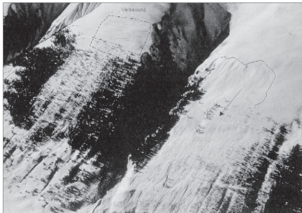
Figure 4. While avalanches can suppress treeline below its climatically-determined limit (right), anthropogenic suppression of avalanches by the construction of snow-supporting structures can dampen this effect, leading to a greater influence of climate on tree growth near treeline and an overall upward expansion of treeline (left)