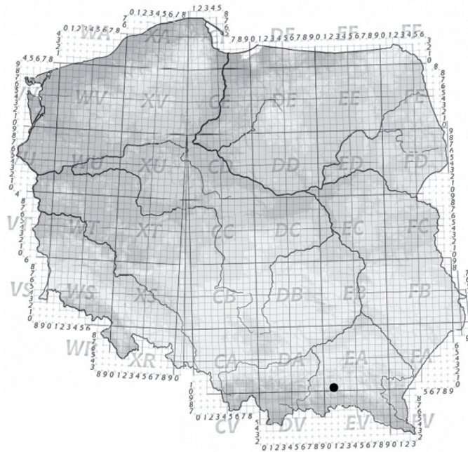
Fig. 1. Location of collection site of Criomorpha williamsi CHINA, 1939.

Ryc. 1. Lokalizacja miejsca odłowu Criomorpha williamsi CHINA, 1939.