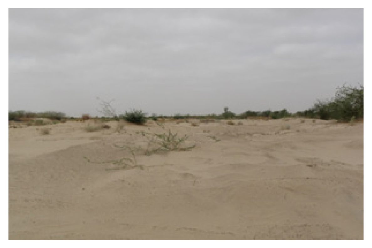
Sandy bed of Luni River during dry season

management. It is indeed a practical and useful methodology for understanding groundwatersurface water interactions in an arid area. Integration of socio-economic data with surface water and climate data proved to be extremely useful for unravelling complexities of this vulnerable ecosystem. This mixed method approach complimented by RS & GIS, can be used for vulnerable flood zone analysis and for developing localised river basin management solutions.