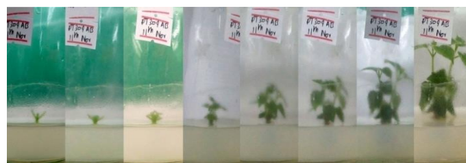
Figure 2: Figure represents a sample of P. tomentosa undergoing in-vitro growth for 7 weeks. The gradual in-vitro growth in plant height as well as biomass can be clearly visualized from this figure.