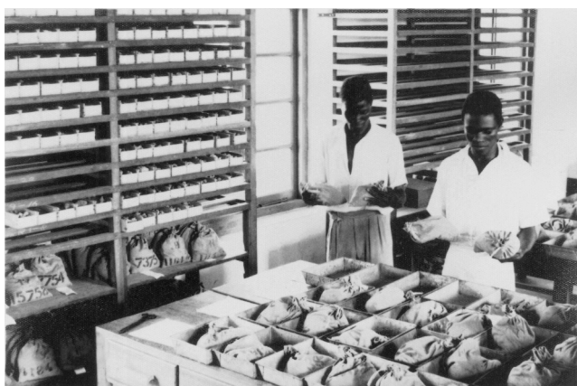
Fig. 4. Soil technicians processing soil samples in Correlation Room at SLUS headquarters, with correlation boxes on the left. (Photograph by H Brammer).

35 × 8 × 5 cm wooden ‘correlation boxes’ for retention in the Soil Correlation room ( Fig. 4 ) and were used to aid consistency of soil identification between surveys ( Brammer, 1965 ). Vegetation collections were similarly retained in the SLUS herbarium.