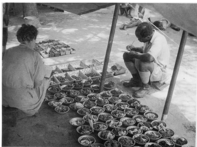
Fig. 3. Soil technician and surveyor processing soil samples at base camp.