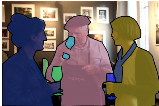
Figure 4. Example of an image in MS-COCO with superimposed ground-truth. Each instance of an object class is labelled separately. For example, each person in this image is segmented using a different colour.

The Microsoft Common Objects in Context (MS-COCO) dataset (90) is also widely referenced in the semantic segmentation community. For the object segmentation task, MS-COCO includes over 200,000 images (all of which are fully annotated) split into 80 categories. However, MS-COCO focuses on instance segmentation 16 rather than on semantic segmentation. In instance segmentation, all objects in the image that belong to different instances of the same object class must be labelled separately (see Fig. 4 for an example). Therefore, the methods reported in Section 3.2, which are semantic segmentation algorithms, were never tested on MS-COCO. Nevertheless, most of the algorithms in Section 3.2 use MS-COCO to pre-train their network, under the assumption that a network pre-trained on a large dataset like MS-COCO will perform better than a randomly pre-trained network (33). The size of the images in MS-COCO varies but is generally within 640x640 pixels.