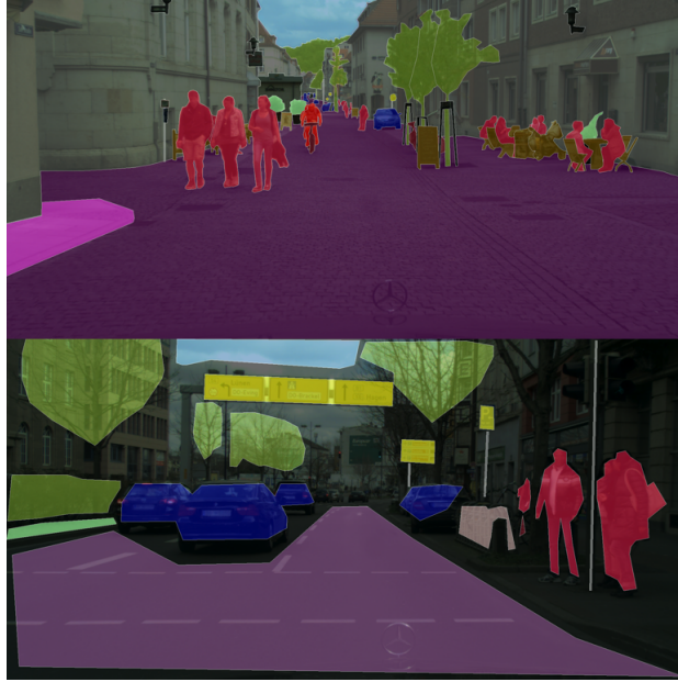
Figure 5. Top: example of a finely-labelled image in Cityscapes. Bottom: examples of a coarsely-labelled image in Cityscapes.