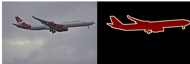
Figure 3. On the left: example of an image in PASCAL VOC 2012. On the right: labelled ground-truth for the image on the left.

PASCAL VOC also provides a public leaderboard that reports the accuracy of the methods submitted to the website. The size of the images in PASCAL VOC 2012 varies but is generally within 500x500 pixels.