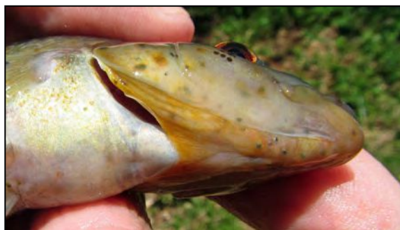
fig. 3. Detail of lower portion of head of the same female of C. yaha showing orange branchiostegal membrane distinguishing C. yaha from C. tesay and the sympatric C. ypo (where in both cases grey).