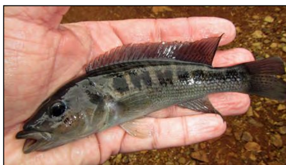
fig. 5. Adult male of C. yaha (MLP uncatalogued) from the arroyo Urugua-í. Note spotted dorsal fin distinguishing males from females.

Distribution and ecology. Crenicichla yaha is endemic to the Urugua-í basin above the original 28 m high waterfall, i.e. above the present dam. It does not however occur in the artificial lake which has everywhere a muddy bottom but is apparently only found in the middle stretches of the main stream and its main tributary (arroyo Falso Urugua-í; figure 6) in areas with bottoms made of stones, boulders and solid rock. Here C. yaha is syntopic with the much more common C. ypo and in rare cases with the undescribed predatory C. sp. Urugua-í line which is common only in the artificial lake. Crenicichla yaha is apparently not present in the upper parts of the main river and the larger tributaries (Falso Urugua-í, Uruzu) and also not in the small tributaries where in all cases only C. ypo is present or where cichlids are absent (headwaters of small tributaries).