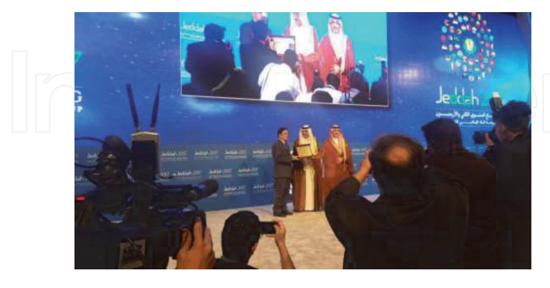
Figure 2. SCEE was awarded the Islamic Development Bank (IDB) prize of excellence in science and technology 2017.