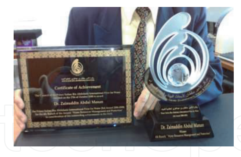
Figure 1. Prince Sultan Abdul Aziz international prize for water as a result of the UNIX program.