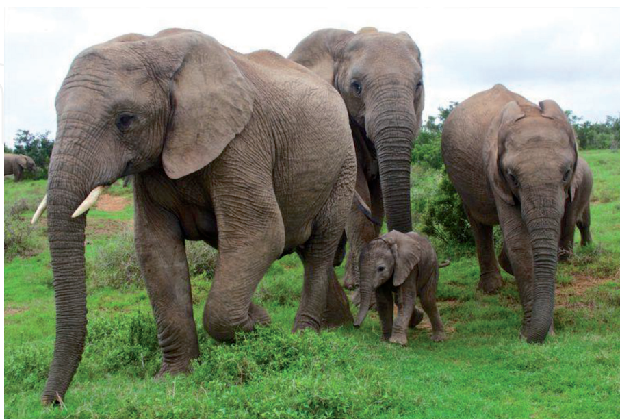
Figure 12. Climate change causes decline in elephant population.