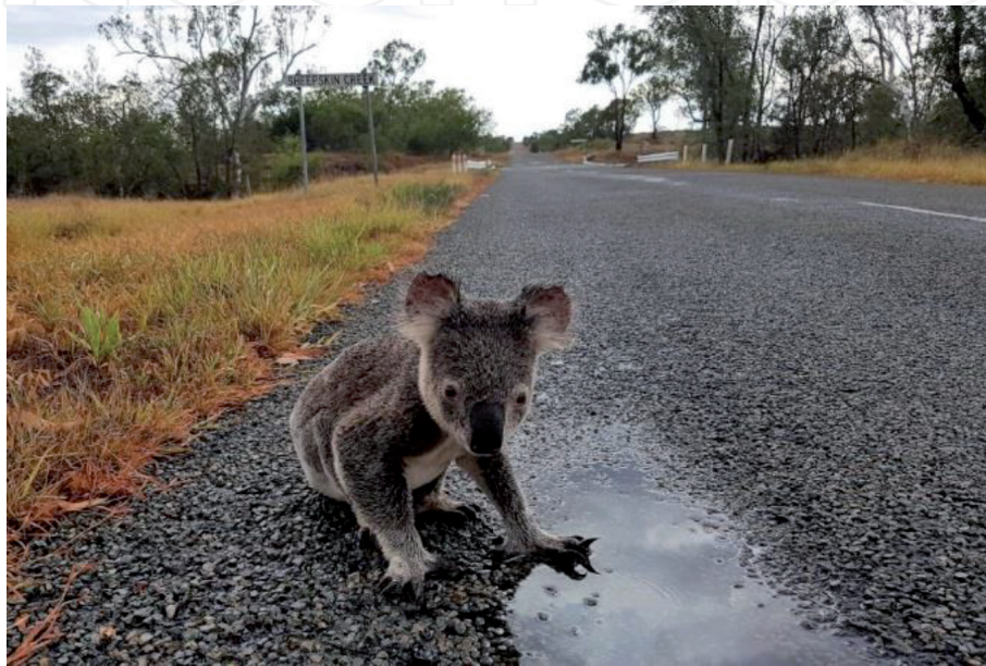
Figure 11. Climate change is responsible for dehydration and malnutrition of koala.

approximately 1 kg of eucalyptus leaves per day. Climate change reduces the amount of water in the eucalyptus tree. The increased carbon dioxide level causes decrease protein levels in the tree affecting plant nutritional quality. All these changes create dehydration, malnutrition, and starvation. Koalas are risking their lives by climbing down from their trees in search of water and food. This leaves them vulnerable to predators and the risk of being hit by cars. Koalas' population has declined by more than 30% over their last three generations ( Figure 11 ) [24]. Elephants require 150–300 liters of water per day for drinking in addition to the amount needed for bathing and playing. Droughts can cause population decline ( Figure 12 ) [25].