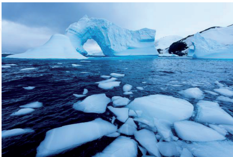
Figure 3. Climate change causes melting of mountain glaciers.

Climate change causes mountain glaciers to melt and accelerates the rate of ice loss on Earth in Greenland and Antarctica ( Figure 3 ). Some glaciers are sites of