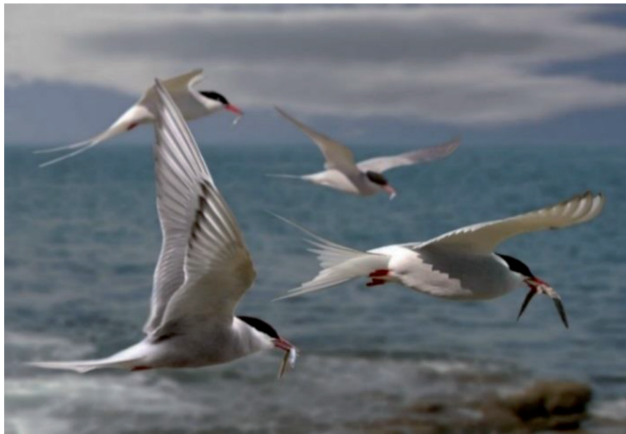
Figure 13. Climate change promotes early avian migration.

Warmer springs have promoted advanced timing of migration and breeding in most avian species in the last decades ( Figure 13 ) [26]. Rising sea levels threaten the sea turtle eggs as most turtles lay their eggs on beaches. Climate change can affect sex determination in several animals [27, 28]. The sex of the sea turtles is determined by the nest temperatures. Cool temperatures produce more males while warm temperatures produce more females. Climate change alters the sea turtles' gender population (females outnumbering males). Certain areas could end up producing only female turtles, with the possibility of local species extinction since there will be no mating partners for female turtles ( Figure 14 ).