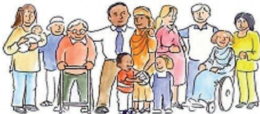
Figure 19. Climate change disproportionately impacts vulnerable populations.

Low-income and geographically vulnerable countries (e.g., Bangladesh) are most affected by the health consequences of climate change (at least in its earlier stages). However, in higher-income countries (e.g., USA), there is also a high