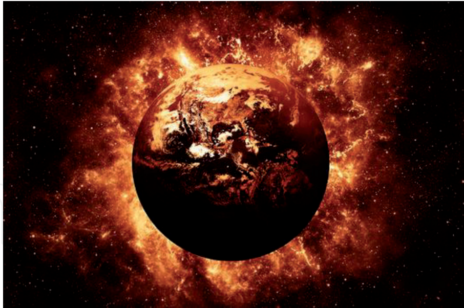
Figure 2. Climate change is associated with increased Earth's temperature.

The rise in global mean temperature is not the same everywhere. There are regional variations in Earth's temperature. Some areas will not even get warmer and may actually get cooler in the short term [4]. Warming is more pronounced at higher latitudes. The North Pole and Northern Hemisphere have warmed much faster than the South Pole and Southern Hemisphere. Greater temperature increases are expected in winter compared to summer and in nighttime versus daytime. Springs occur earlier and winters are milder.