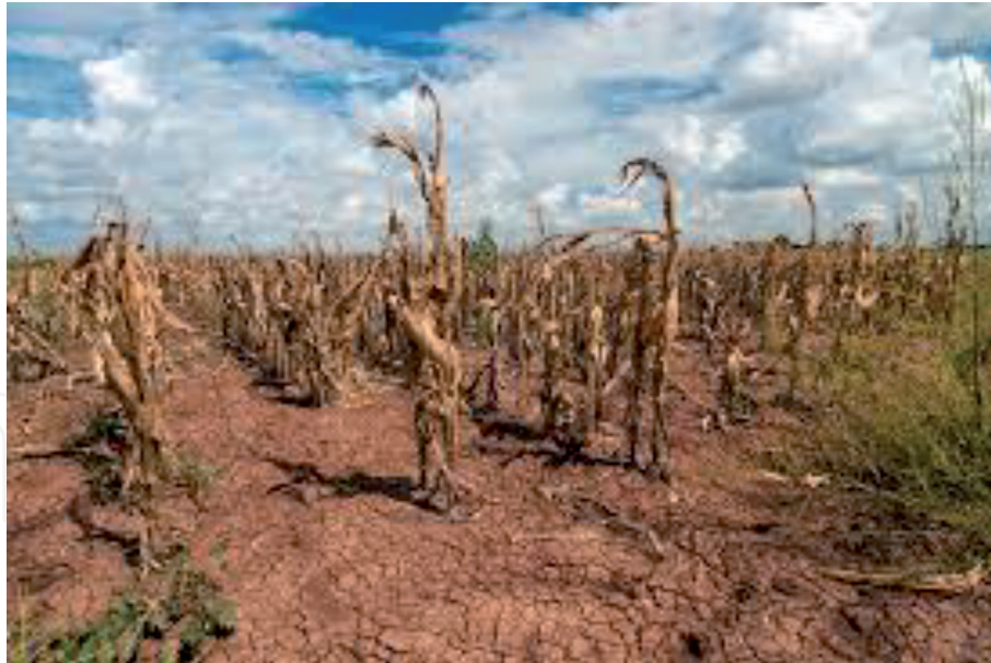
Figure 8. Climate change challenges plant survival.

agriculture is the most endangered activity adversely affected by climate change. The decreased farming activity will lead to food insecurity.