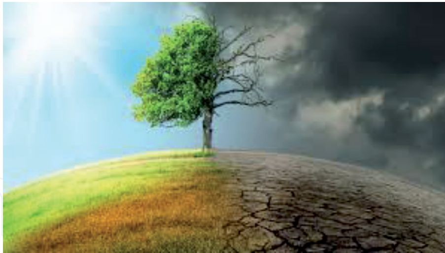
Figure 1. Climate change causes global changes of the planet.