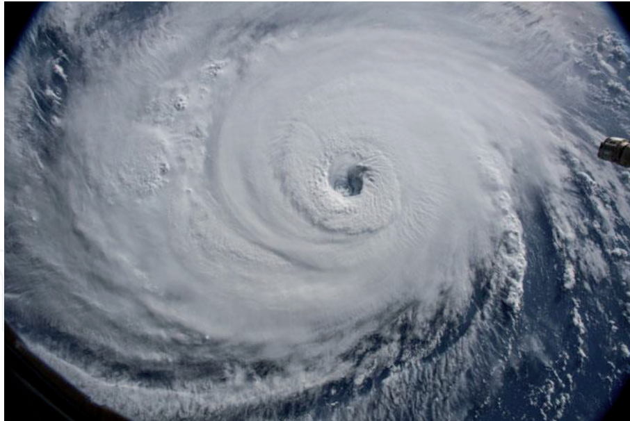
Figure 5. Climate change promotes more dangerous hurricanes.