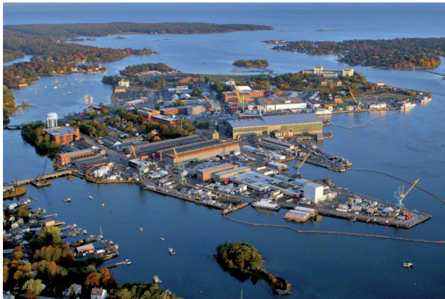
Figure 4. Climate change triggers rise in sea levels.

The salty ocean water will challenge native plants and animals to adapt to the changing conditions. For humans, it causes salination of freshwater supplies and loss of productive farmlands [8]. Low-income countries (e.g., Bangladesh) are particularly impacted.