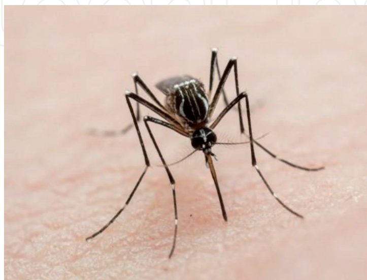
Figure 17. Climate change favors spread of infectious diseases.

Climate change through variations in temperature, precipitation/humidity, wind, and solar radiation influences the spread of some infectious diseases since these variations may impact the survival, reproduction, and distribution of disease pathogens and vectors/hosts as well as their transmission environment. Several infectious diseases are involved including malaria, dengue, and Lyme disease ( Figure 17 ) [3, 34].