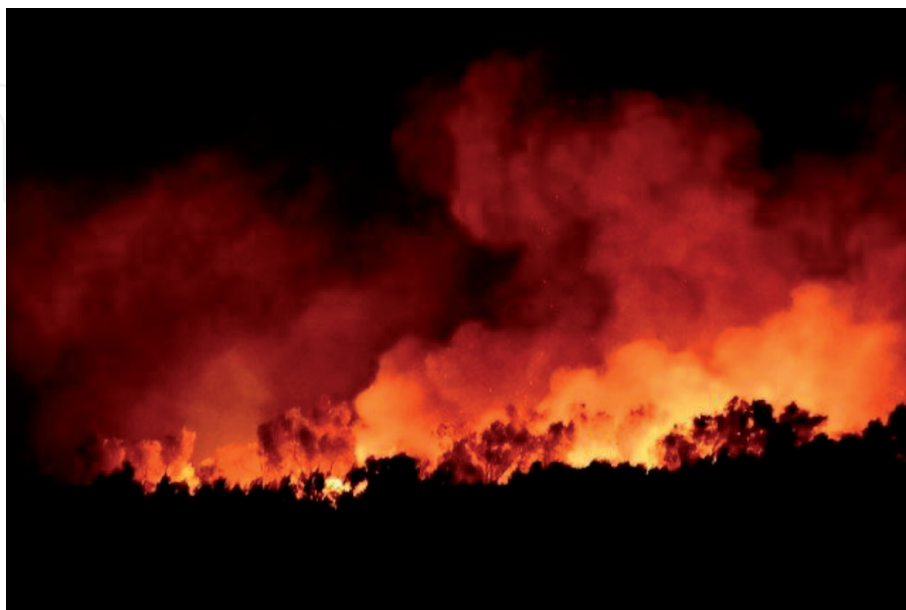
Figure 6. Climate change causes more frequent wildfires.

Climate change causes more frequent wildfires. The dry, hot weather has increased the intensity and destructiveness of forest fires in several countries (e.g., Brazil, USA, and Australia) ( Figure 6 ) [10, 11]. Wildfires can cause deforestation, serious property damage, exposure of large populations to prolonged periods of polluted and toxic air with potential health impacts (e.g., respiratory diseases), and death. Amazon (Brazil) has become more flammable and vulnerable to wildfires during recent droughts [10]. California (USA) has experienced devastating autumn wildfires in recent years [11]; over 100 fatalities were directly attributed to the most destructive and deadliest wildfires that occurred in 2017 and 2018.