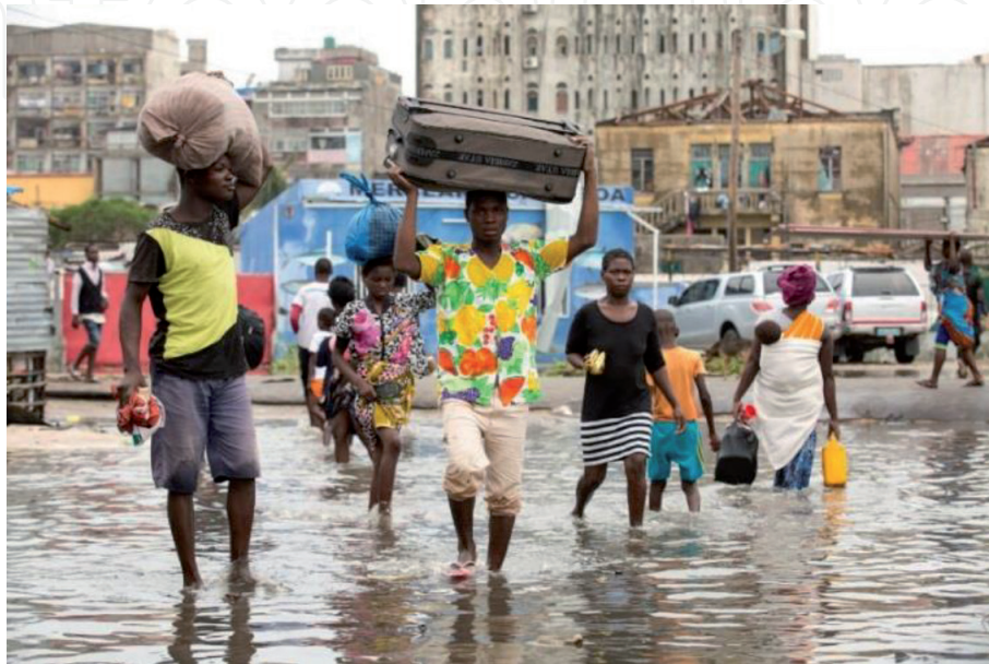
Figure 18. Climate change causes population movement.

Climate change by creating unsuitable living conditions (e.g., desertification, sea-level rise, decline in freshwater availability, food shortage, health issues) will move many people (forced displacement, planned resettlement, migration). Poor communities are particularly impacted by the human movement. It is estimated that by 2050, up to several hundred million persons will be moved ( Figure 18 ) [32]. Population movement will expose countries to multiple challenges (e.g., social, health, and financial consequences and violent conflicts).