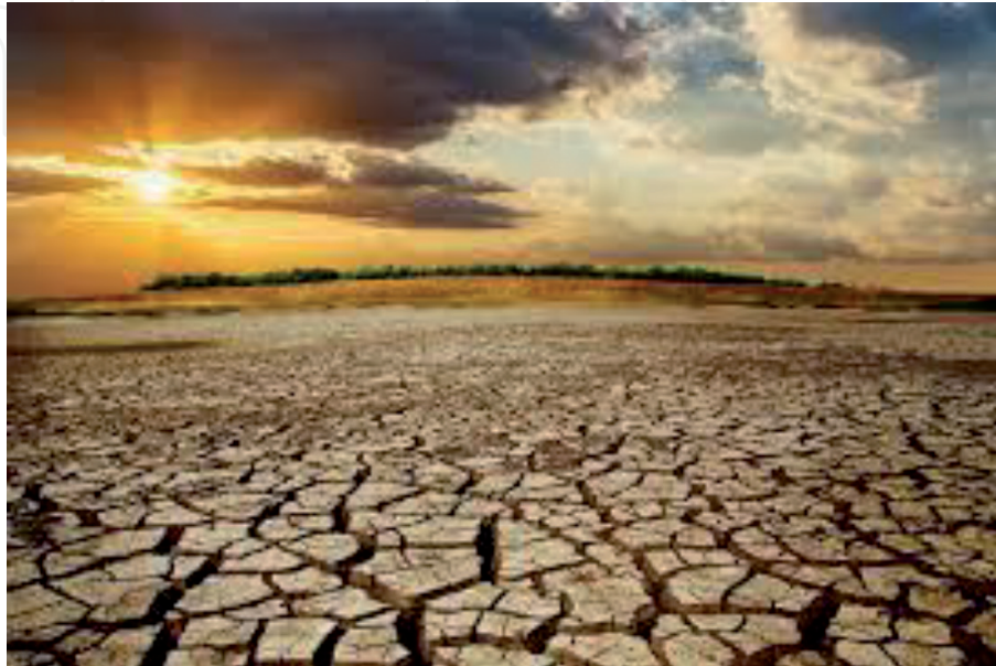
Figure 7. Climate change is responsible for more frequent and severe droughts.

Drought is a complex and multivariate phenomenon influenced by diverse physical and biological processes. Drought is among the most expensive natural disasters. Climate change is responsible for more frequent and severe droughts (especially in subtropical regions), promoting the expansion of deserts ( Figure 7 ) [4, 12]. This will lead to misery, hunger, starvation, and population movement.