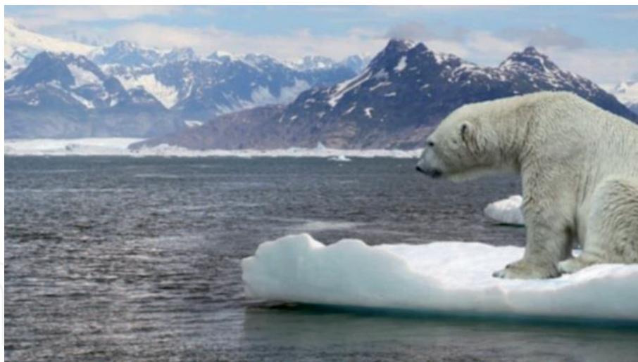
Figure 10. Climate change causes loss of habitat for polar bear.

Climate change can cause habitat degradation or loss for several species (e.g., polar bears, koalas, and birds). Polar bears are dependent on sea ice. The increased temperature is causing the arctic sea ice to melt, damaging the polar bears' habitat ( Figure 10 ) [23]. Koalas are dependent on eucalyptus tree. The increased temperature and drought are causing wildfire, destroying the koalas' habitat [24]. Lake Urmia (Iran) is a bird habitat and used to be a popular tourist destination. The lake is drying up mainly because of climate change.