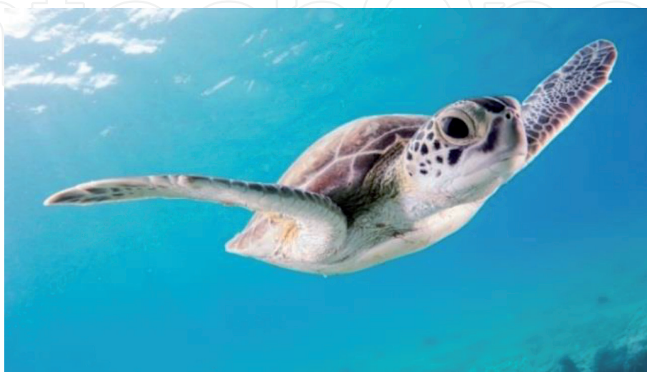
Figure 14. Climate change leads to female sea turtle overpopulation and domination.