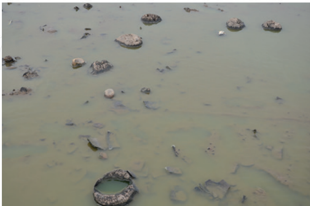
Figure 1. Map of the stilt villages in eastern Amazon and apparent stilts at the time of the drought.