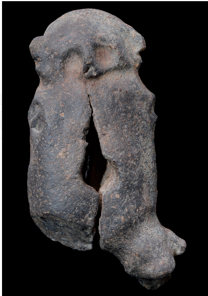
Figure 4. Figurine in the shape of squirrel monkey (Saimiri collinsi).

Regard to iconography, it happens through geometric lines or traces that delimit patterns within the stylistic composition of the vase: they are Greeks, zigzags or spirals taking up the interior of the pieces. We can see, that there are two opposite iconographic fields divided by one or two lines across the piece. Mostly the motifs differ in these two fields. For instance, when the square motifs were used in one artistic field, then the circular elements were selected for the opposite one. Red and black were the predominant colours, which were painted on cream engobe or white.