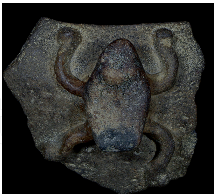
Figure 5. Vessel frog appliqué of the stilt villages.