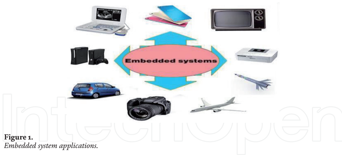
Figure 1. Embedded system applications.

Embedded system spread in many devices, and the users of these devices are capable of performing almost all the network/internet applications that run on these devices. These devices are also involved in transport of secure data over public networks that require defence from unauthorised access.