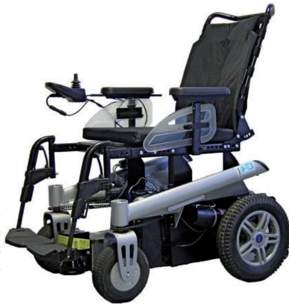
Figure 2. Intelligent wheelchair.

In this chapter, ICMetric technology is integrated into an intelligent wheelchair. MEMS sensors embedded in intelligent wheelchair are utilised to ensure effective usage and to provide identification of intelligent wheelchair.