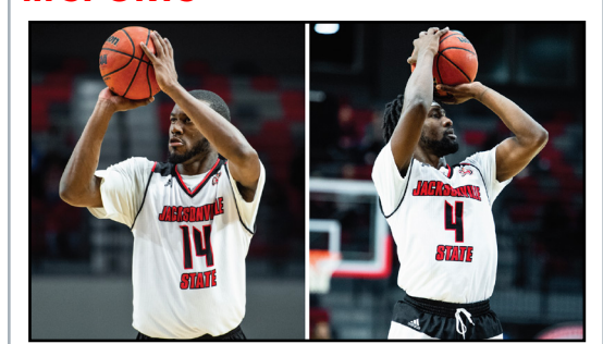
Gamecocks duo receives OVC , national honors Page 8