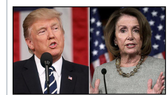
Shutdown enters fifth week