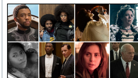
2019 Oscar Nominations released Page 5