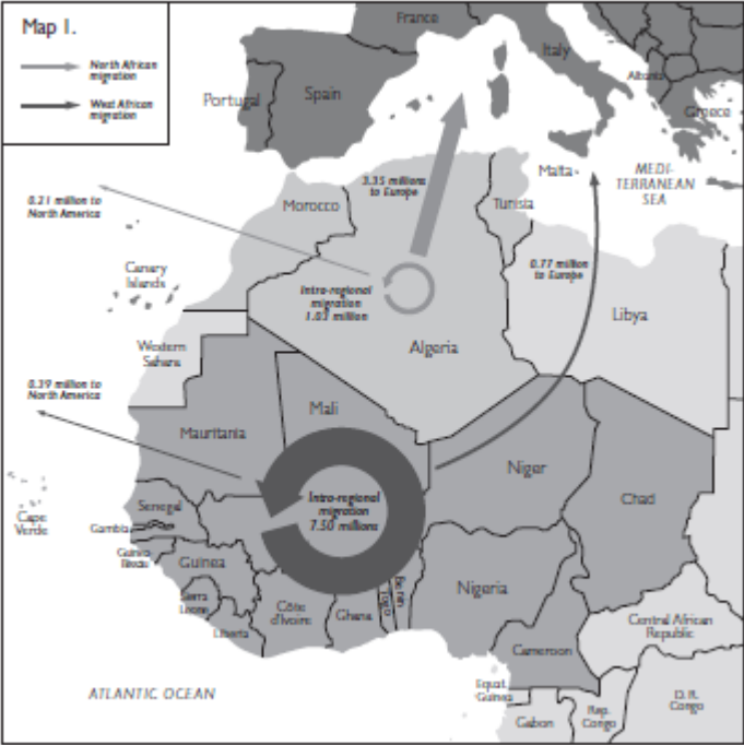
Fig 1: Intra-regional & international migration in West Africa

these countries in the late 1980s and 2000s. In addition, West African states also experienced labor, commercial and professional migration within the region and to various destinations and countries in Europe, South East Asia, the Arab-Gulf region and North America (See Figure 1) (Ikwuyatum, 2016, 2012; Olsen, 2011; Afolayan et al, 2009)