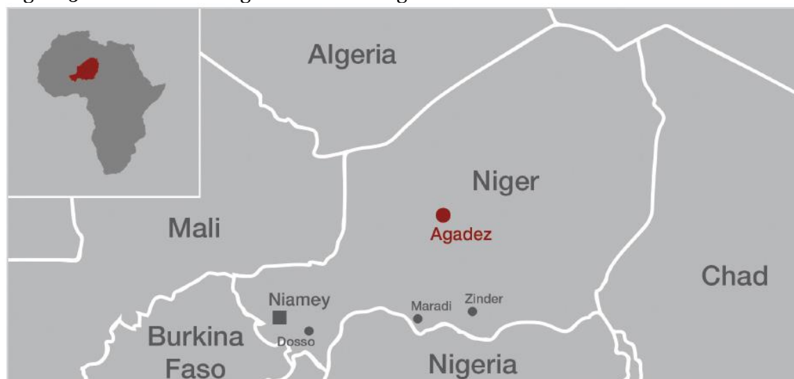
Figure 5: Countries sharing borders with Niger