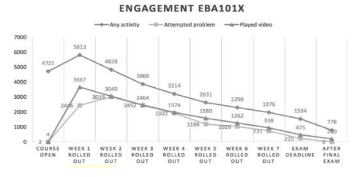
Figure 2. Engagement Index

Note. Reprinted from PARTICIPANTS'ENGAGEMENT IN AND PERCEPTIONS OF ENGLISH LANGUAGE MOOCs, by McMinn, S. 2017.