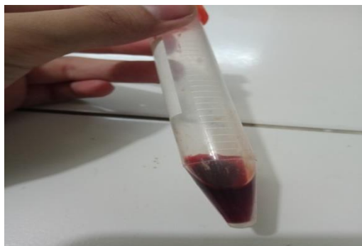
Figure 1. shows the blood sample before centrifugation process

Table 1 shows the effectiveness of Terminalia Catappa's leaf extract on increasing the prothrombin time of chicken's blood.