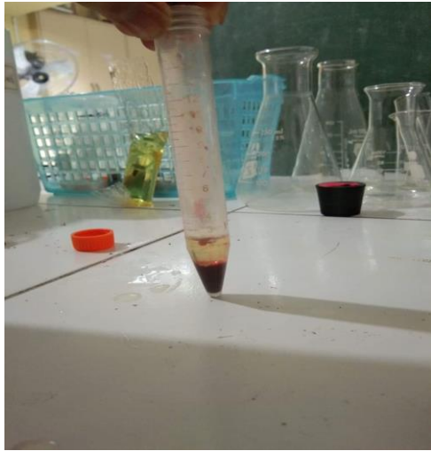
For Normal Prothrombin Time