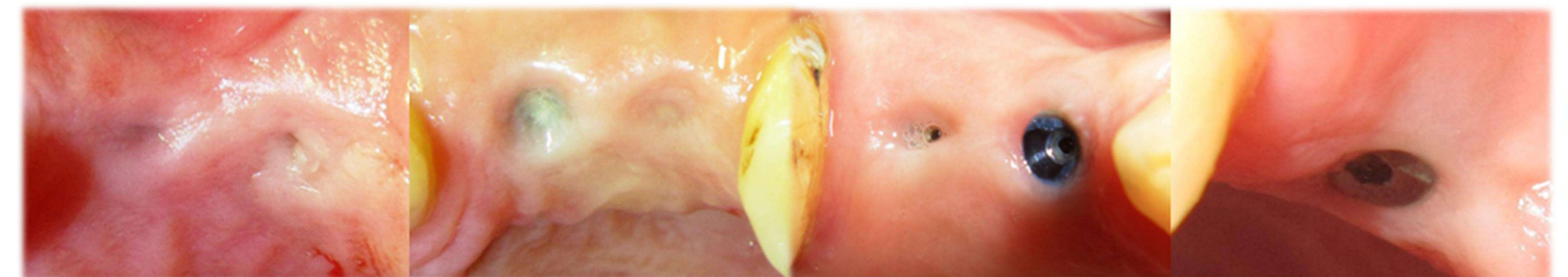
Fig. 2. Different types of early implants exposure, met in the Control Group.

The cause of early implants exposure is the inflammatory process that develops as a result of the microbial contamination of the intra-implantation space at the first surgical step. The application of antimicrobial drugs may significantly decrease the frequency of dehiscence as well as bone loss.